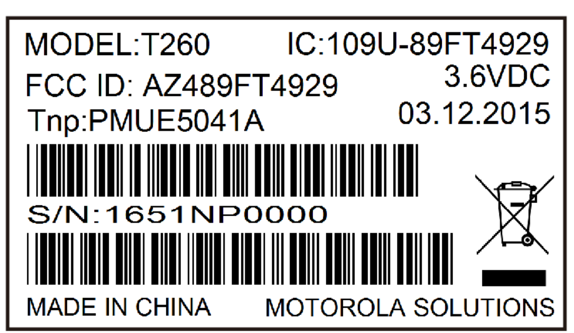
Figure 1: FCC IC Label for Sales model T260