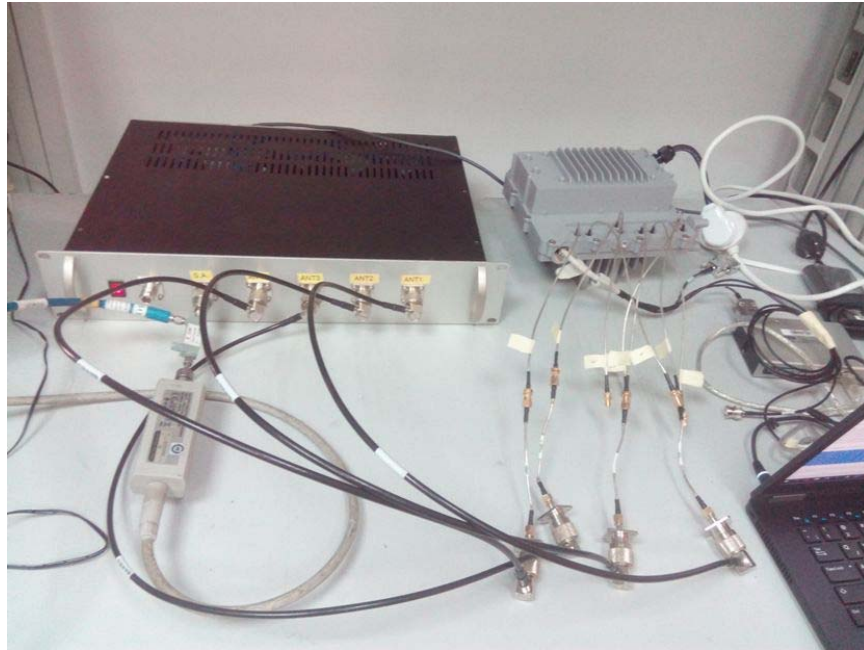
Photograph No.1 Peak output power, conducted spurious emissions, occupied bandwidth measurement setup