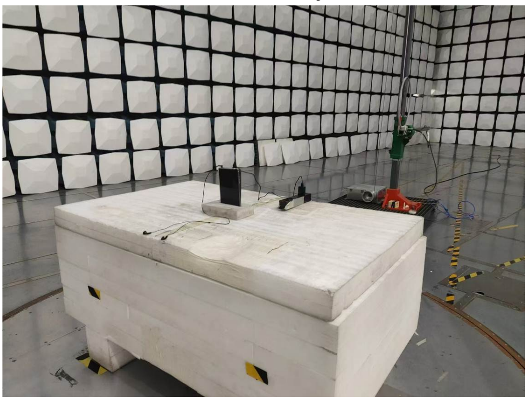
Radiated Emission 9k-30MHz Perpendicular View

Radiated Emission 9k-30MHz Parallel View