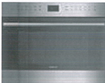
MDD24TE/S/TH – This is a 24" wide, stainless steel model (Metal control Panel)

In our application for FCC Approval there are three individual models, these are as follows: -