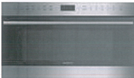
MDD30TE/S/TH – This is a 30" wide, stainless steel model (Metal control Panel)