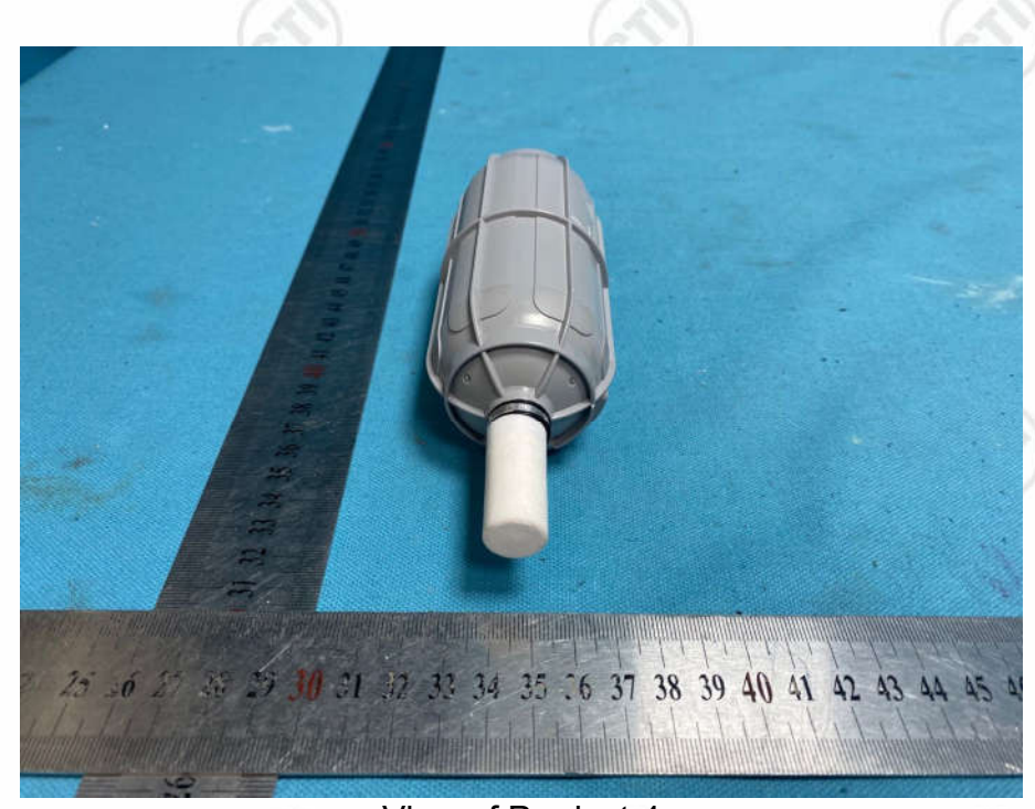
View of Product-4