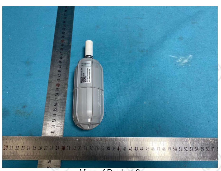
View of Product-2