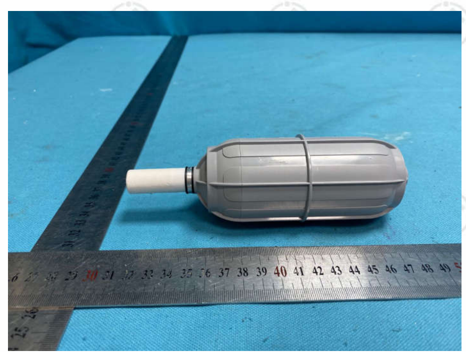
View of Product-5

Report No. : EED32L00335501 Page 43 of 54