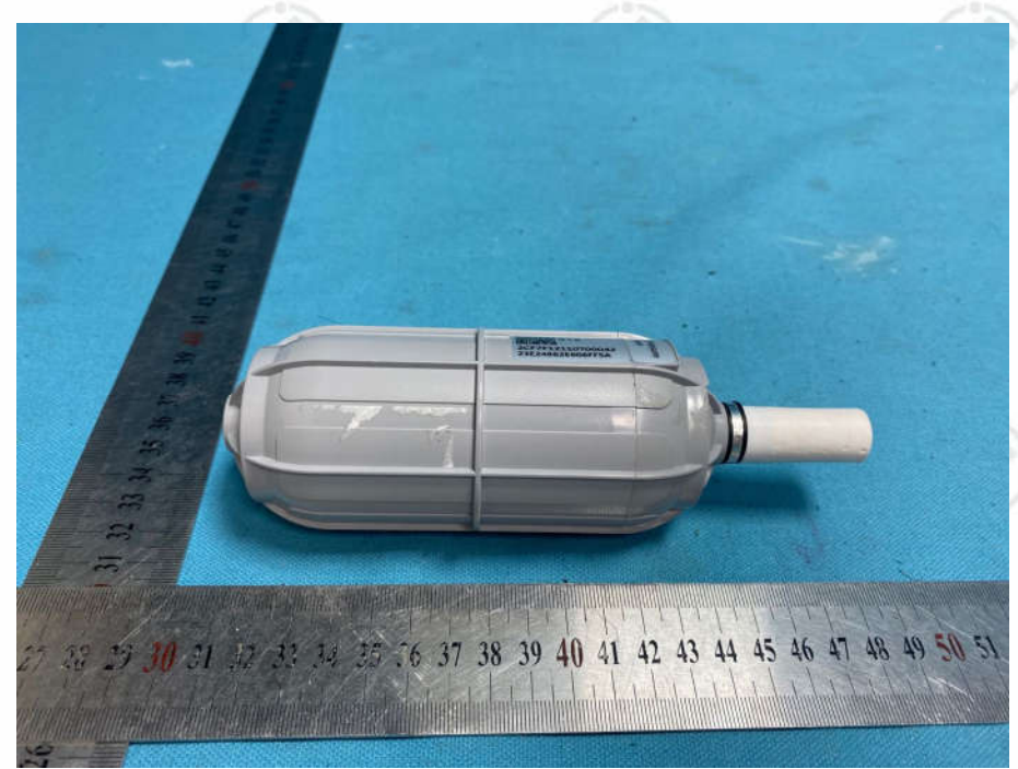
View of Product-3