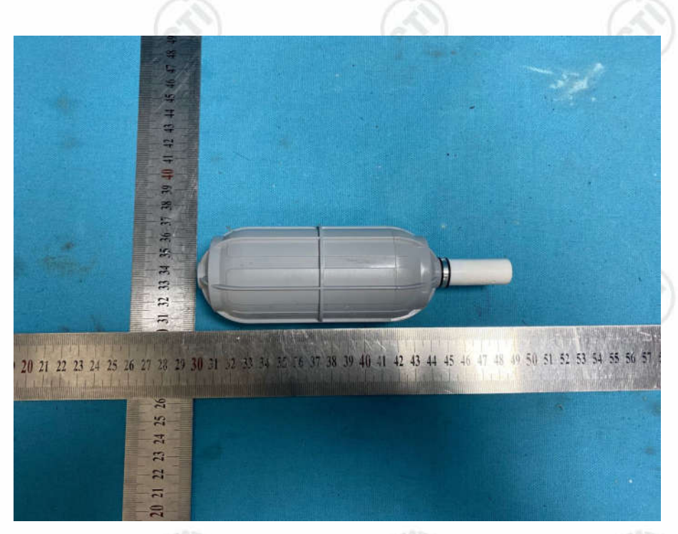
View of Product-6