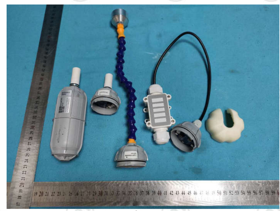
View of Product-1