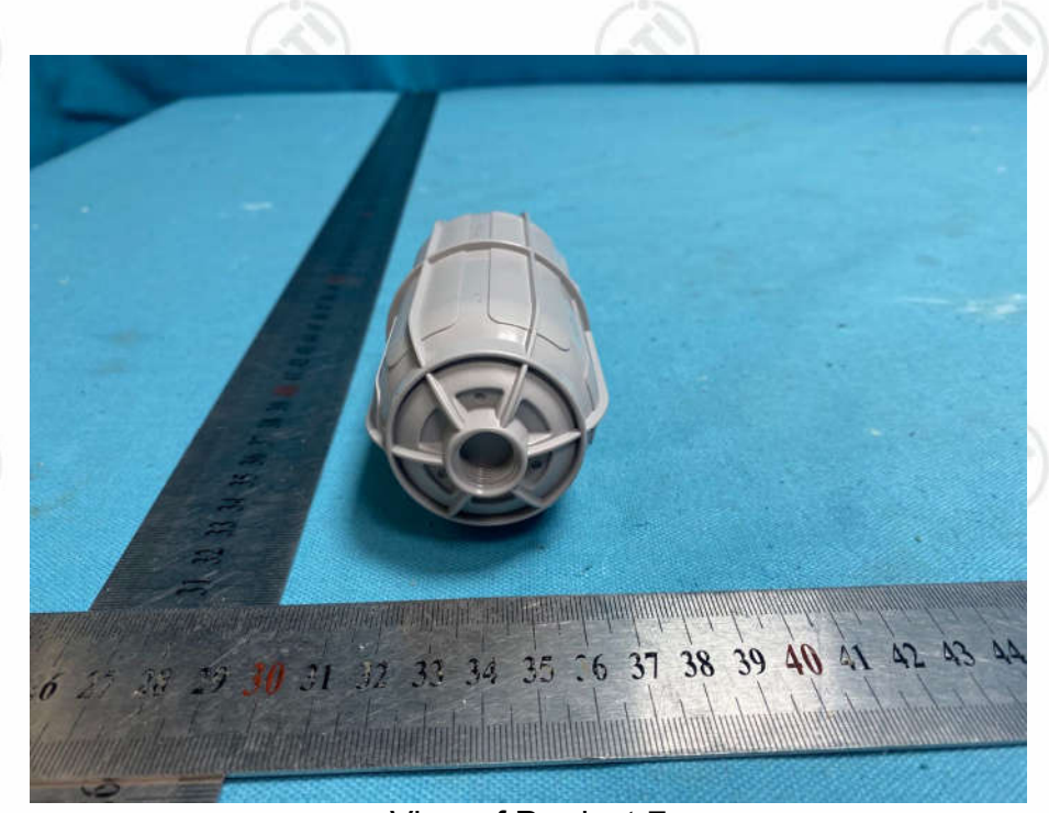
View of Product-7