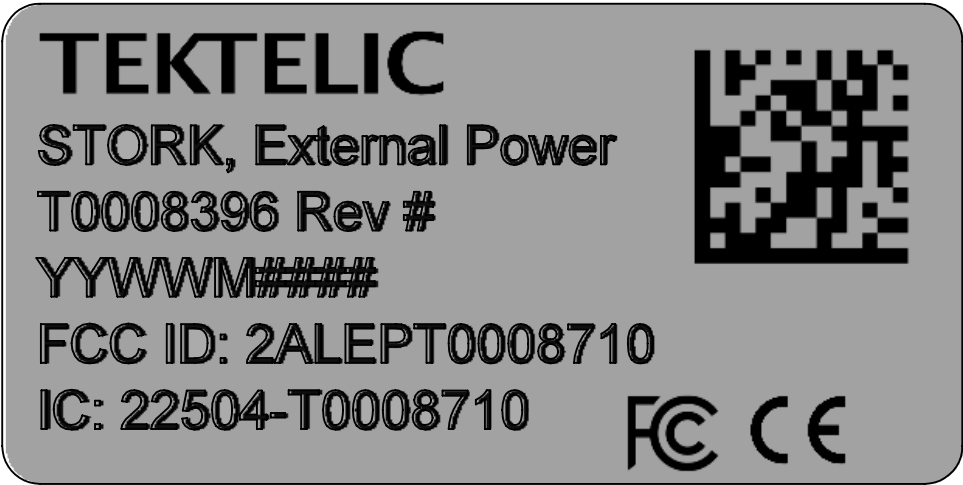
SENSOR, NA, EXTERNAL POWER