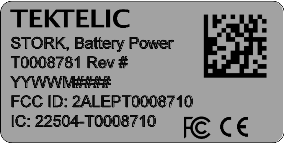
SENSOR, NA, BATTERY POWER