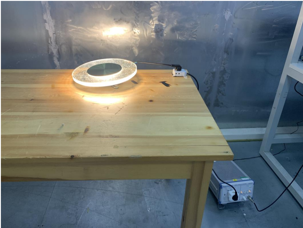
Conducted Emission-AC adapter charge mode