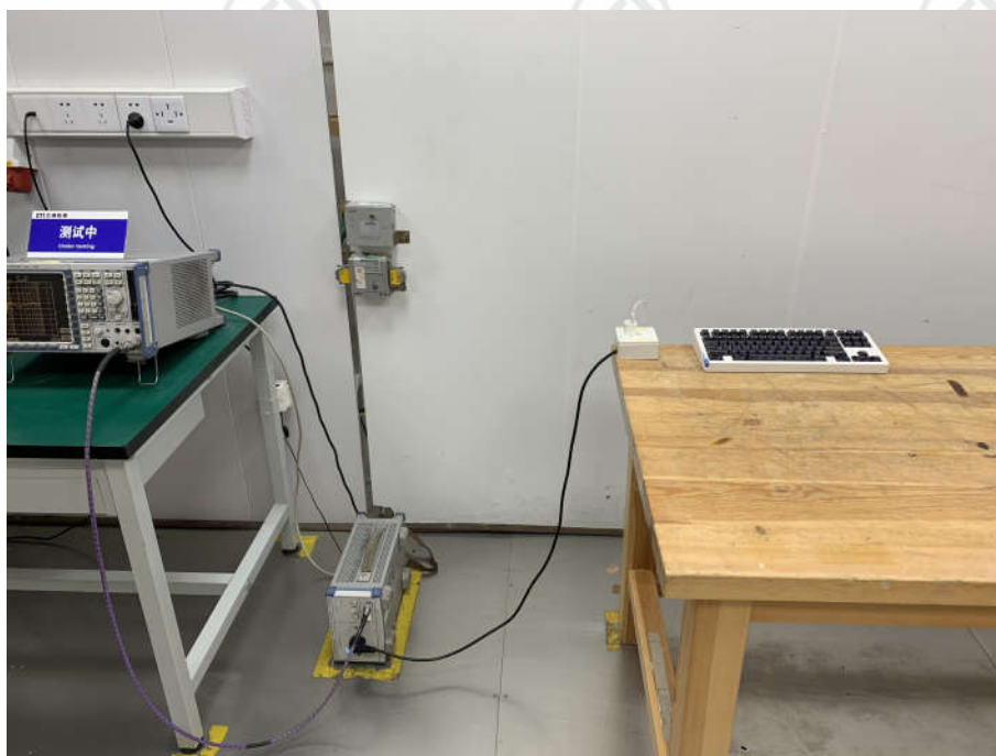
AC Power Line Conducted Emission