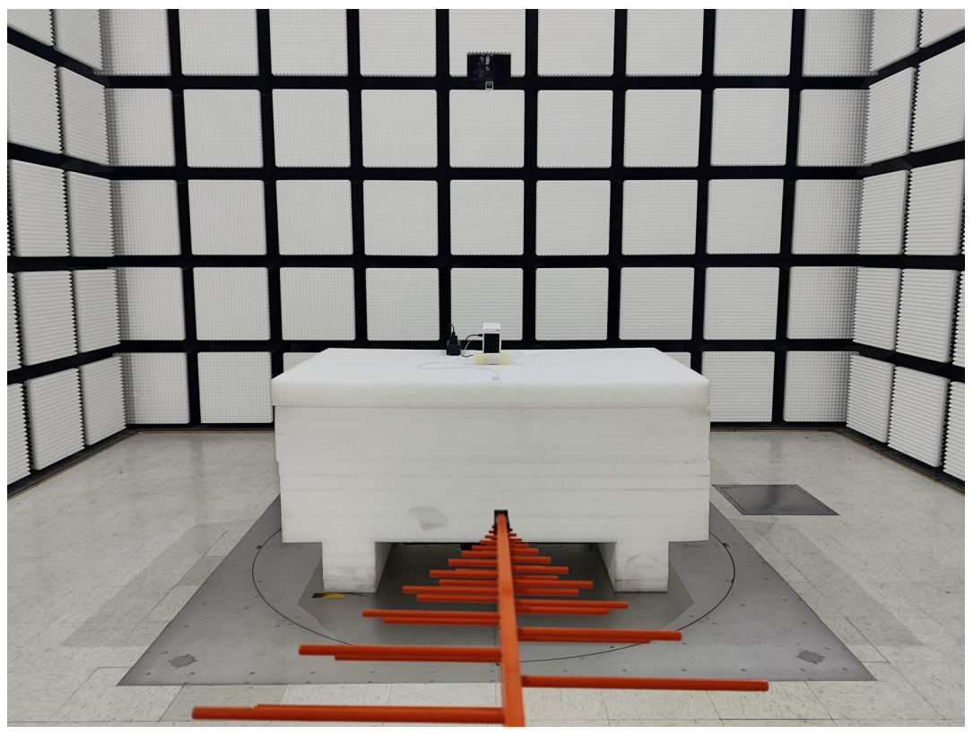
Page 3 of 4