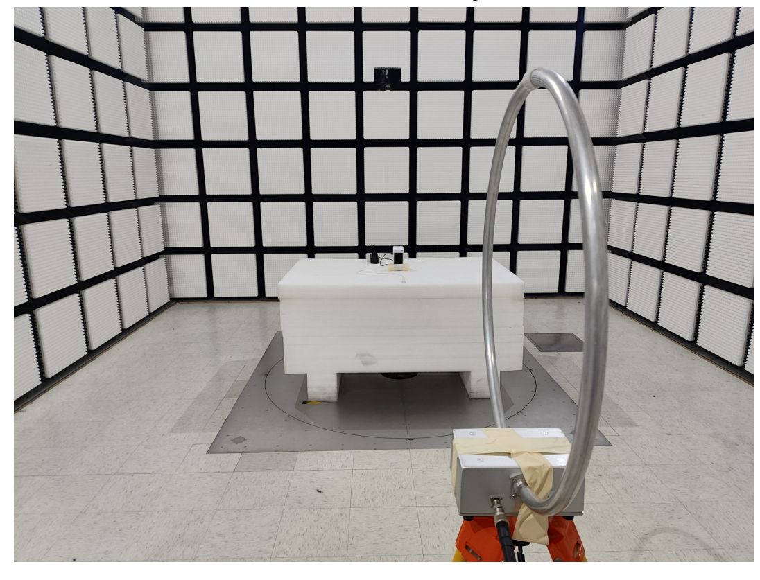
Page 2 of 4