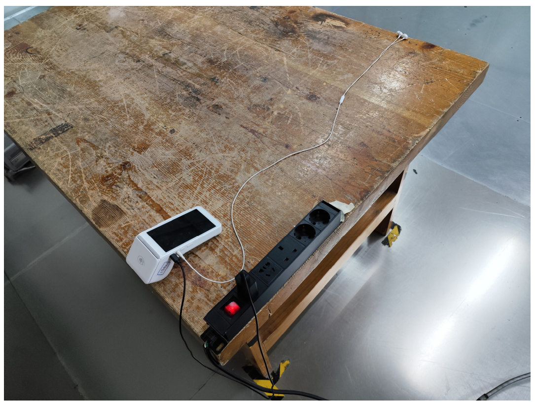
Page 1 of 4