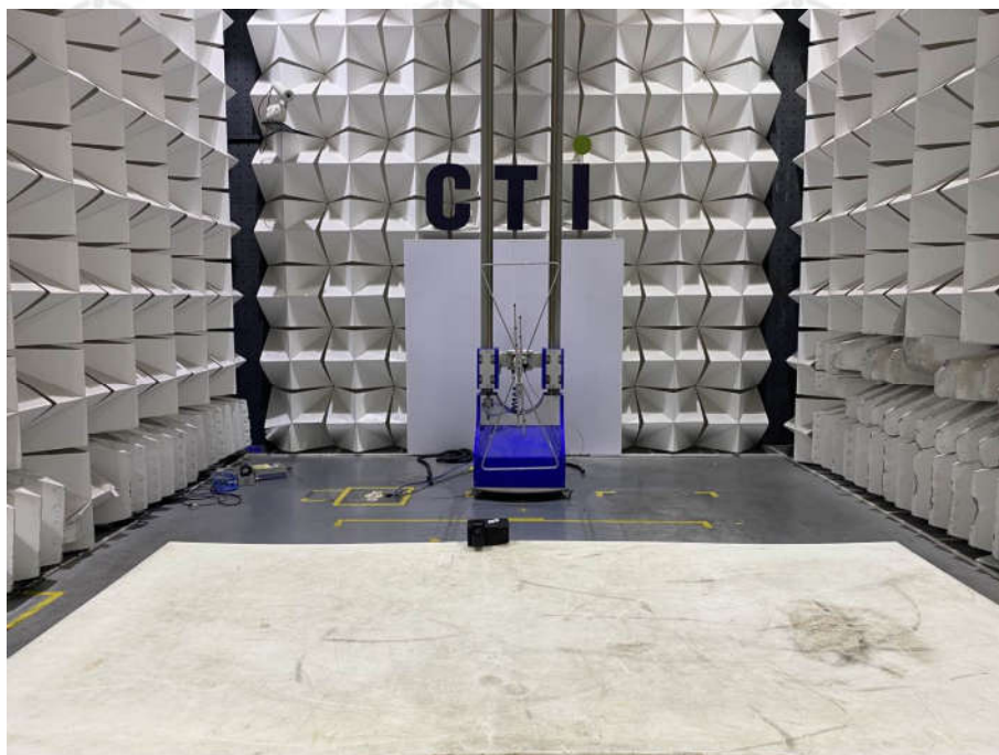
Radiated spurious emission Test Setup-1(Below 1GHz)