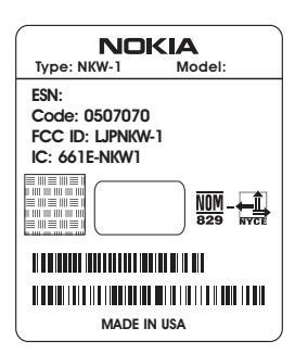
Exhibit 1: Type Label Position FCC ID: LJPNKW-1