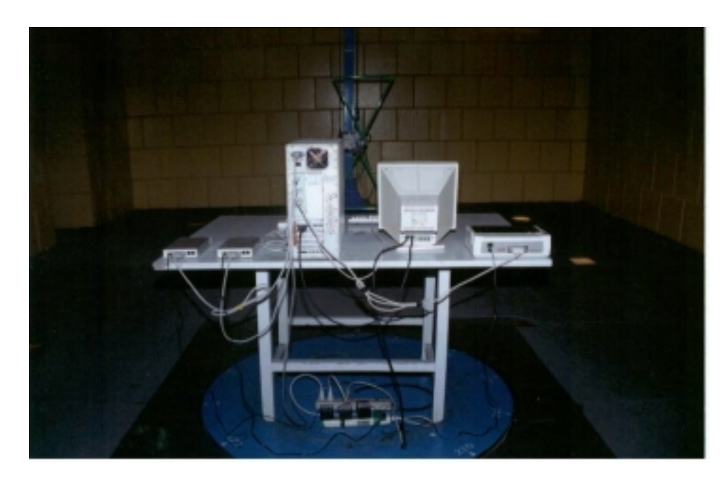
BACK VIEW OF RADIATED MEASUREMENT