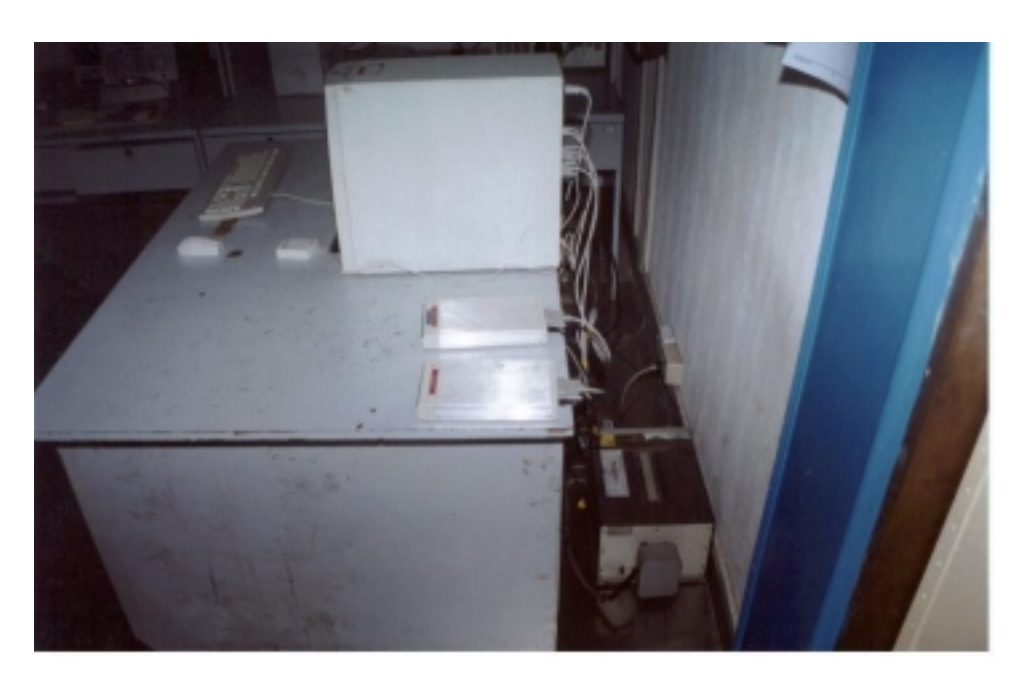
SIDE VIEW OF CONDUCTED MEASUREMENT