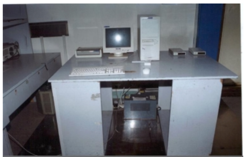
FRONT VIEW OF CONDUCTED MEASUREMENT