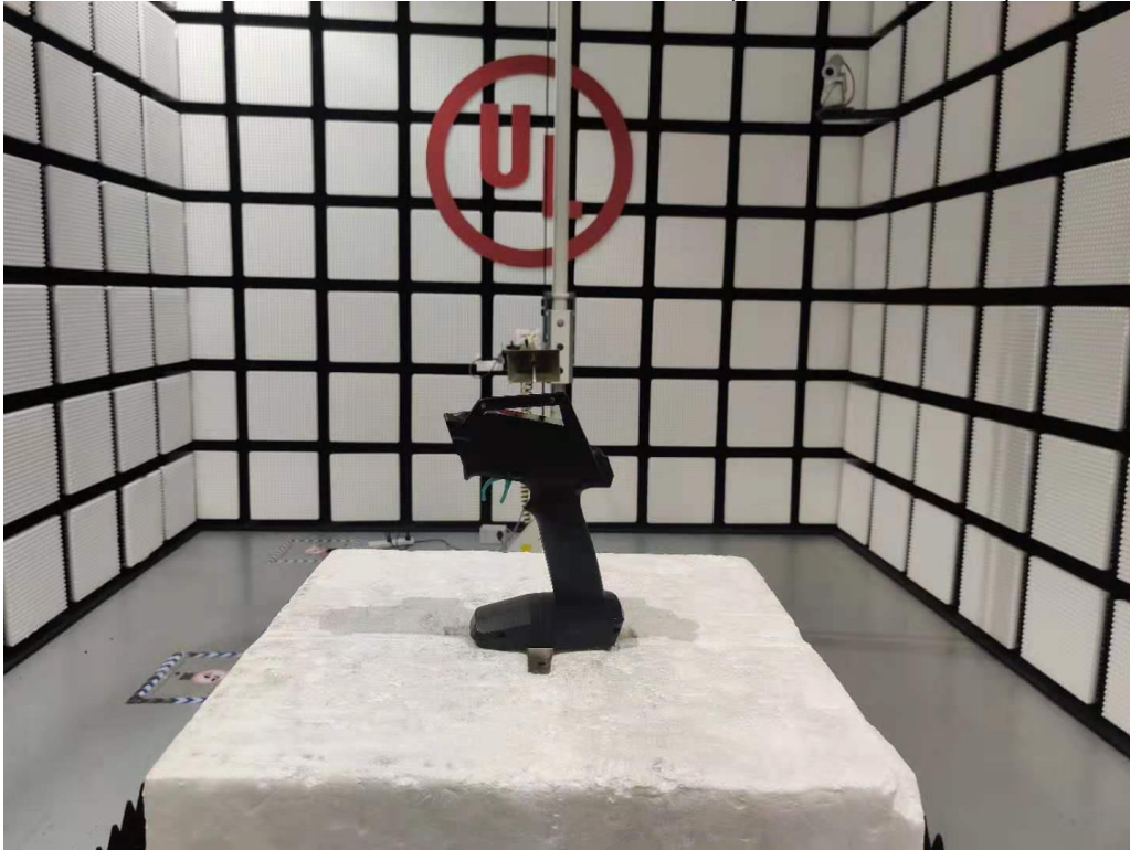
RADIATED RF MEASUREMENT SETUP (Above 1G – Y axis)