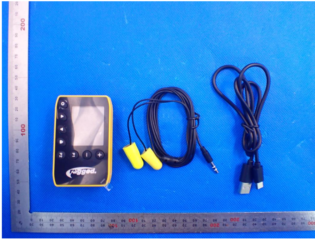
TOP VIEW OF EUT