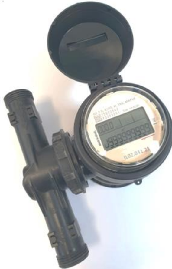
Figure 1 – Allegro Cellular PIT Module

The Allegro IOT Interpreter LR9 Module is a battery-operated radio module designed for automated water meter reading. The Allegro IOT meter provide optional online data of all kinds (water consumption, temperature, Alerts, Tampering, back flow ...) Integrated Bluetooth Low energy for field maintenance