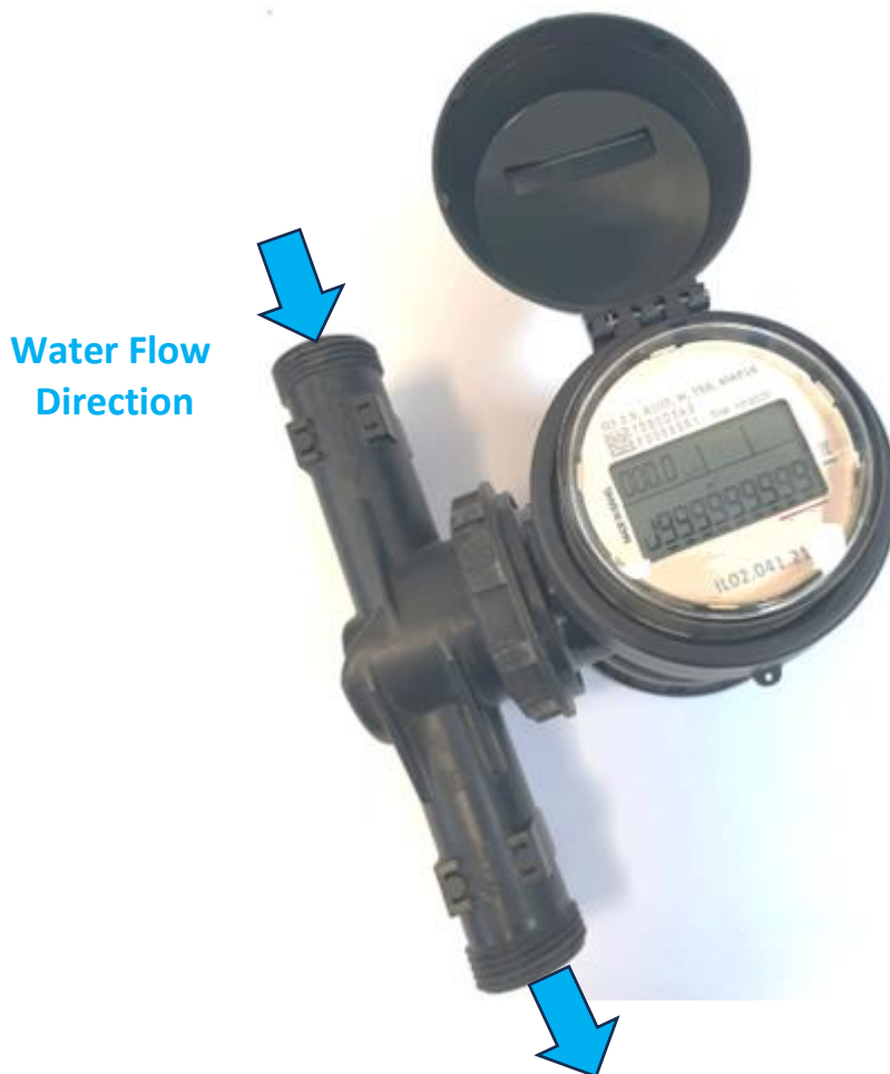
Figure 2 – Operation setup illustration

Several operational modes are available based on production configuration, standard mode transmits four times a day 24-hourly meter reads.