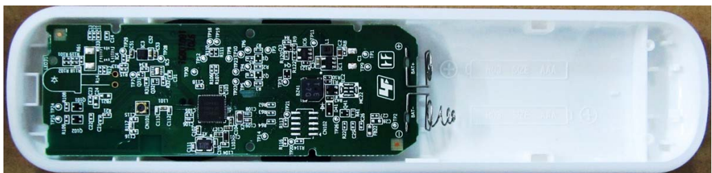
Location of PCB