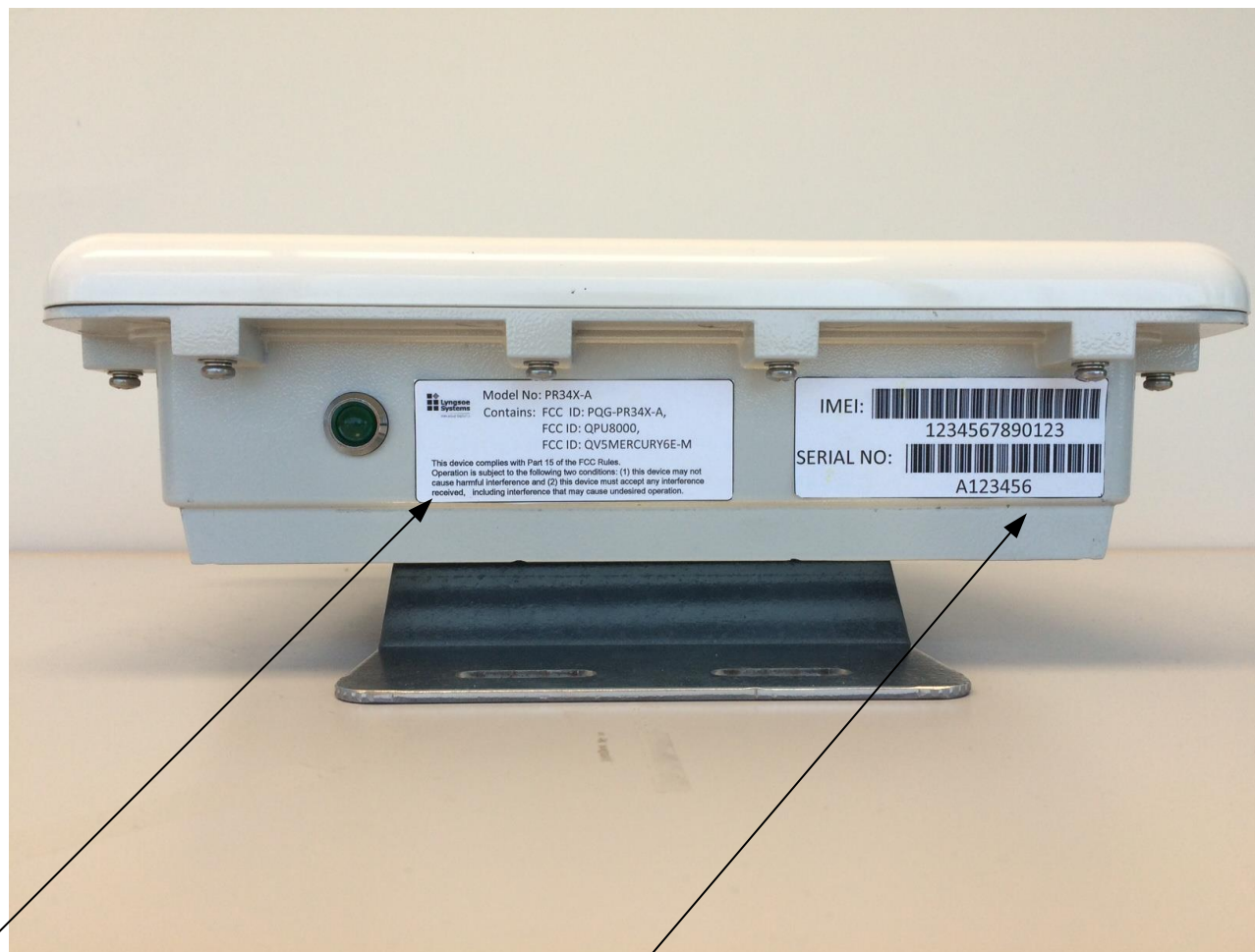
FCC Label Placement : PN 450462