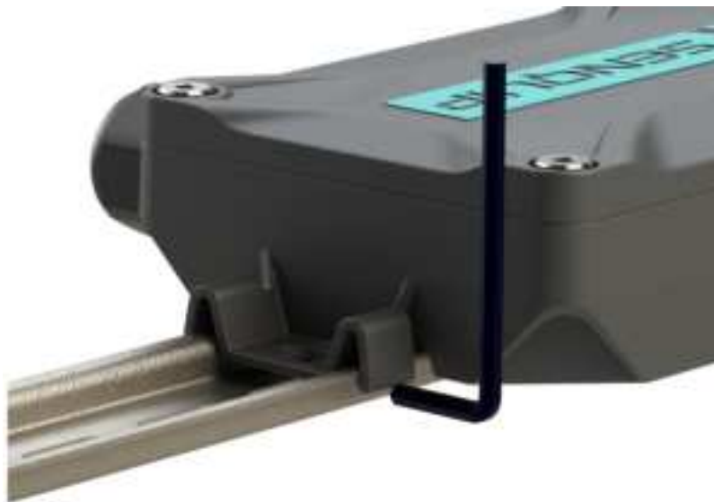
Figure 2.4. Removing from a DIN Rail

Remove the Senquip QUAD from the DIN Rail using the Allen Key as shown in the image below.