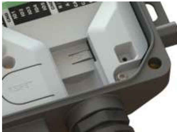
Figure 2.10. Identifying the SIM card slot

To access the SIM card holder, the lid must be opened. The SIM card holder is located at position 1 in the diagram below. The holder is a “push-push” type, meaning that the SIM card is pushed in to install and is then pushed and released to eject.