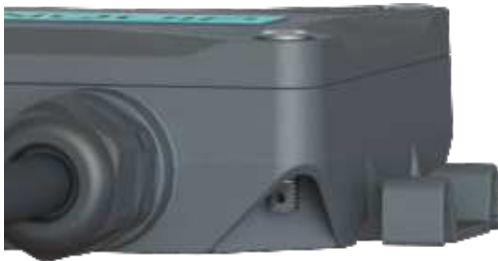
Figure 2.8. Tamper evident screw in place on a Senquip QUAD

Note The tamper evident screw should be inserted last and removed first. The tamper evident screw should be inserted and removed with a 4mm Allen key.