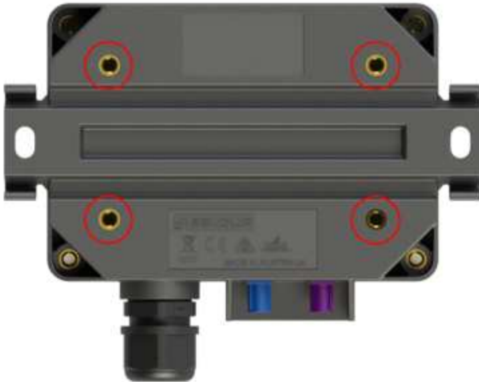
Figure 2.2. Senquip QUAD mounting points circled in red

The Senquip QUAD can be wall or bulkhead mounted, or can be attached to a DIN rail using the integrated mounting clips. When wall or bulkhead mounting, use M5 bolts.