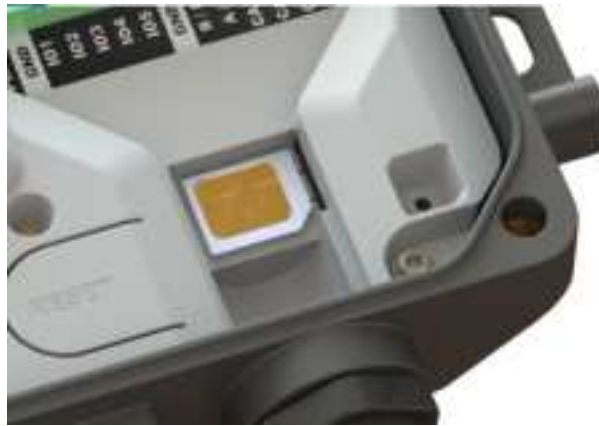
Figure 2.11. Correct insertion of a SIM card

Because the Senquip QUAD is expected to be used in harsh environments, there is a plastic locking mechanism moulded into the plastics. Once the SIM card is inserted, the plastic lock will lift, securing the SIM card in the holder.