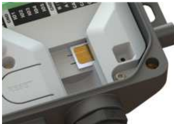
Figure 2.12. Insert SIM to the right

Because the Senquip QUAD is expected to be used in harsh environments, there is a plastic locking mechanism moulded into the plastics. Once the SIM card is inserted, the plastic lock will lift, securing the SIM card in the holder.