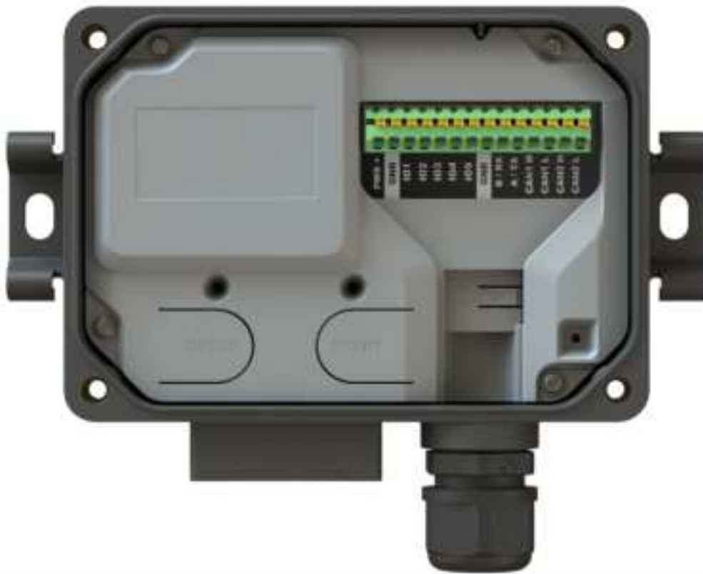
Figure 2.5. User access for the Senquip QUAD