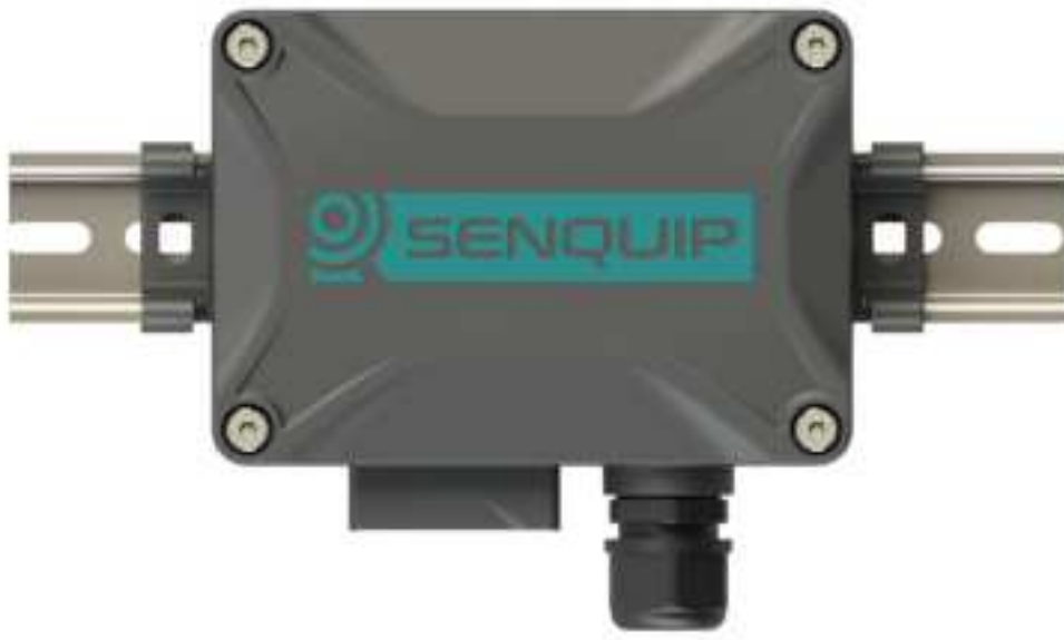
Figure 2.3. Rail mounting the Senquip QUAD

Remove the Senquip QUAD from the DIN Rail using the Allen Key as shown in the image below.