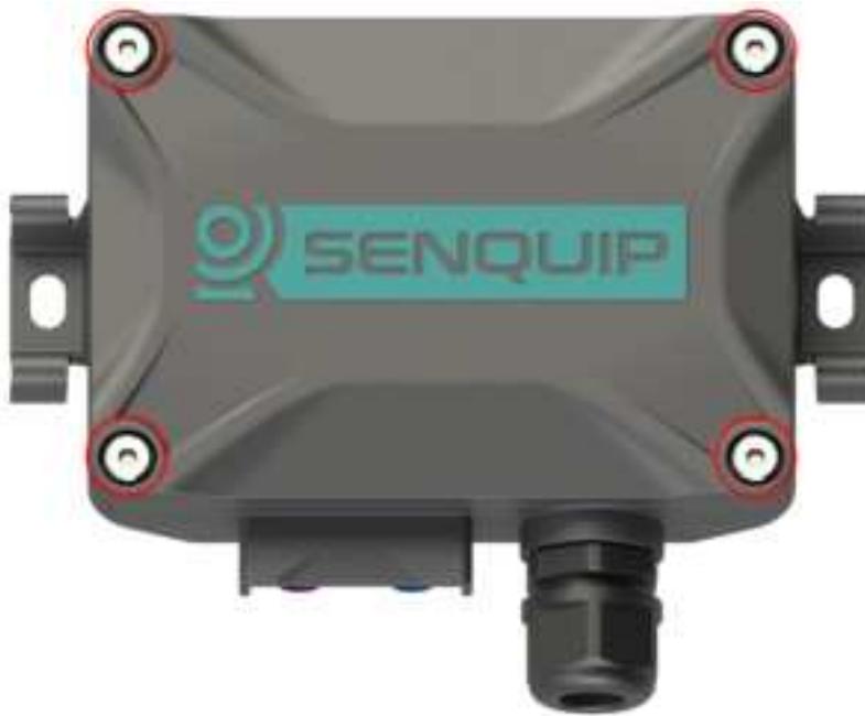
Figure 2.6. Four cover screws