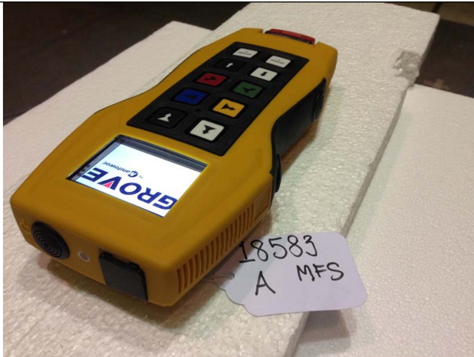
Radiated Emissions to 18 GHz; Power, Spurious