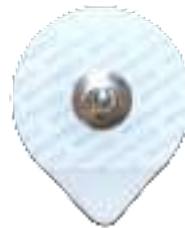
Back side (electrode buckle side)