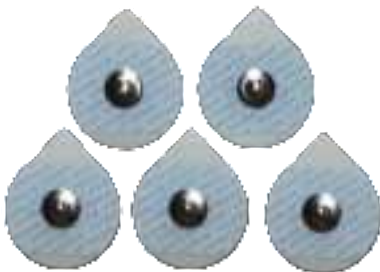
Disposable electrode sheets