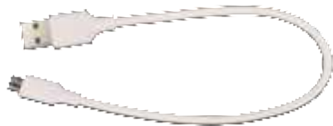
USB charging cable