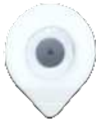
Front (glue side)

Disposable electrode sheets consist of self-adhesive stickers, electrode buckles, sponge or non-woven backing, pressure-sensitive adhesive, silver/silver chloride electrodes, and anti-stick films. Users can purchase disposable ECG electrode sheets with an electrode buckle diameter of 3.7-3.8 mm.