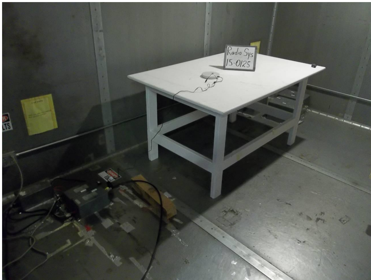
Figure 5. Power Line Conducted Emissions Test Setup

FCC Part 15 Certification/ RSS 210 KE3-3003079 2721A-3003079 15-0125 June 3, 2015 Radio Systems RAC00-15373