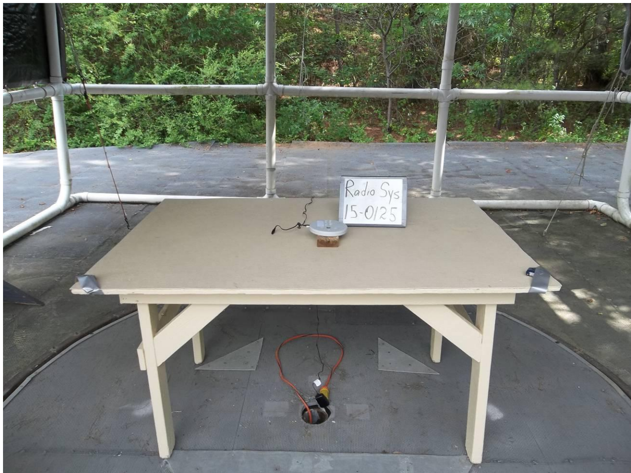
Figure 1. Radiated Emissions Test Setup