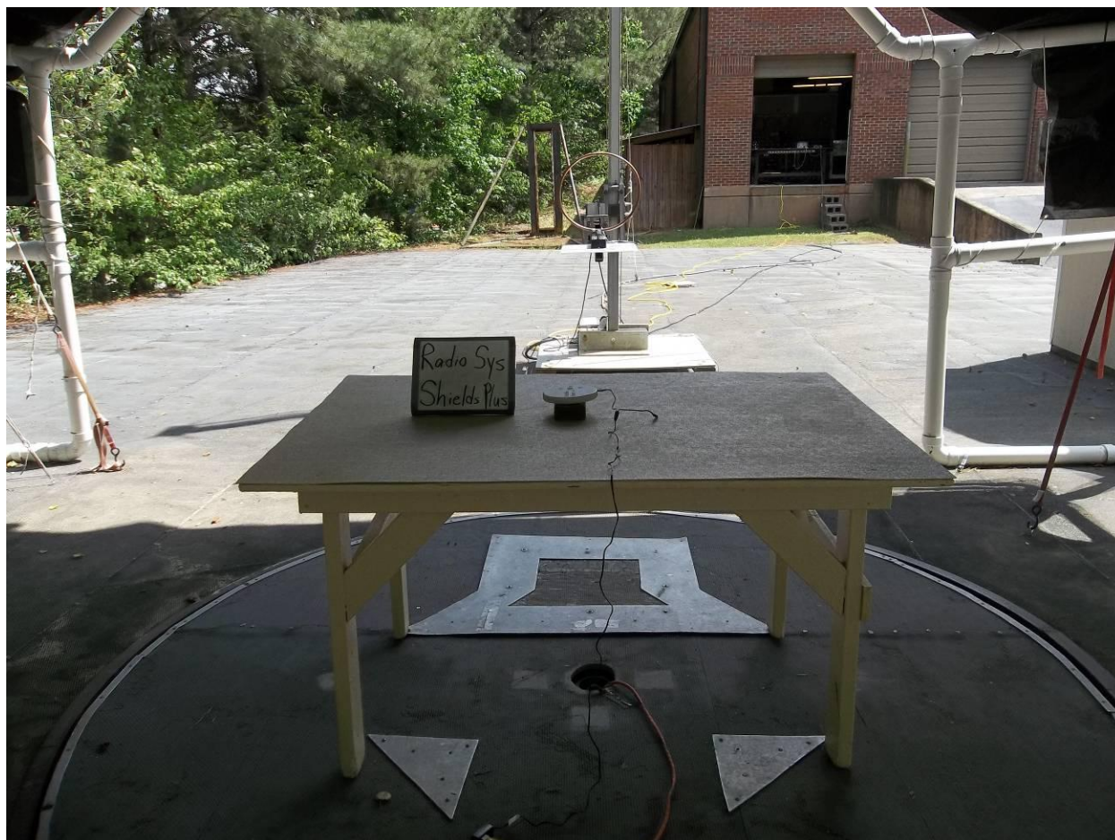
Figure 2. Radiated Emissions Test Setup (Below 30 MHz)

FCC Part 15 Certification/ RSS 210 KE3-3003079 2721A-3003079 15-0125 June 3, 2015 Radio Systems RAC00-15373