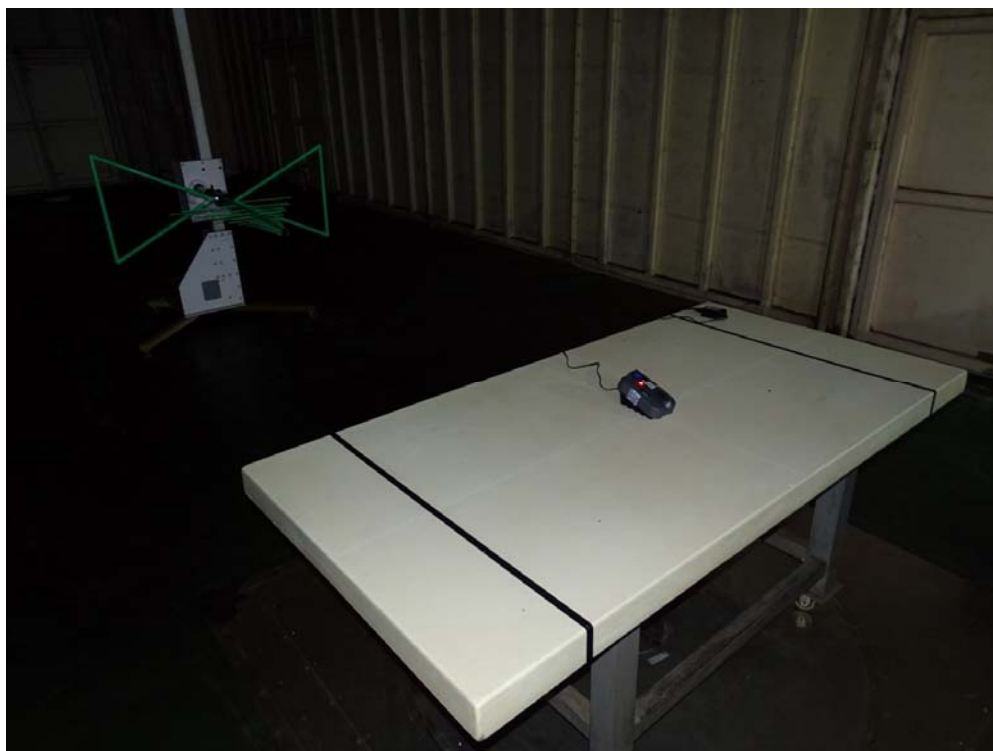
Back View of Radiated Test (Charger mode)