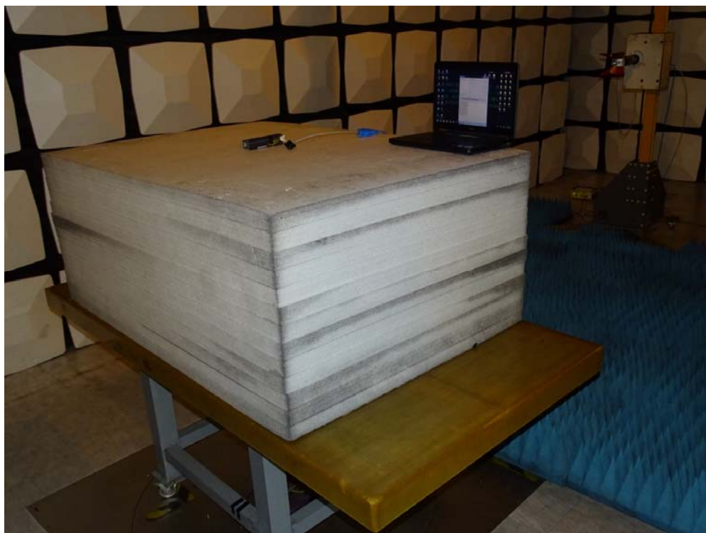
Back View of Radiated Test (Horn)