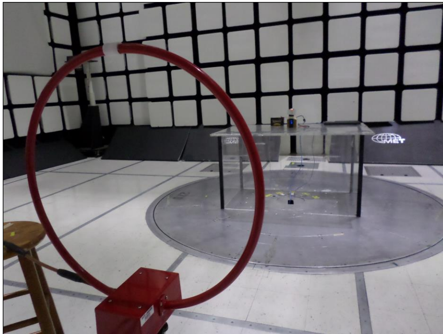
Photograph 2. Emissions Within the Band 13.553 – 14.01 MHz, Loop Antenna View