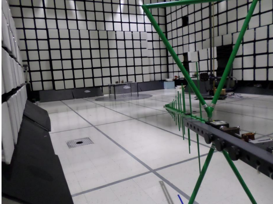
Photograph 3. Spurious Emissions, Outside the Bands, Bilog Antenna View