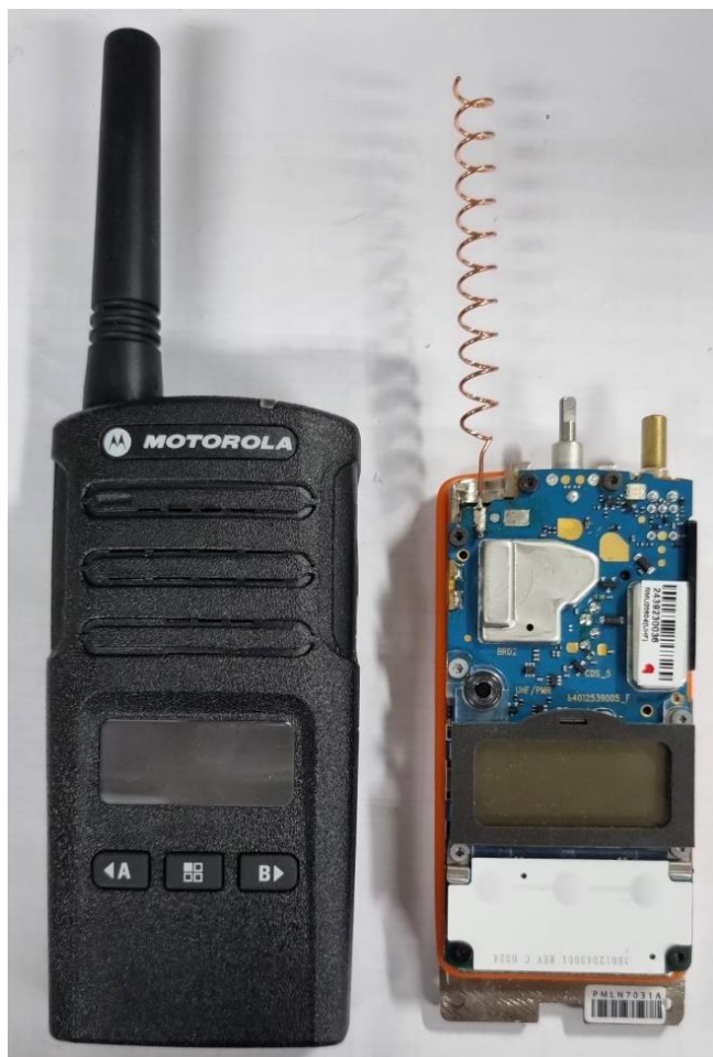
RMU2080 / RMU2080d