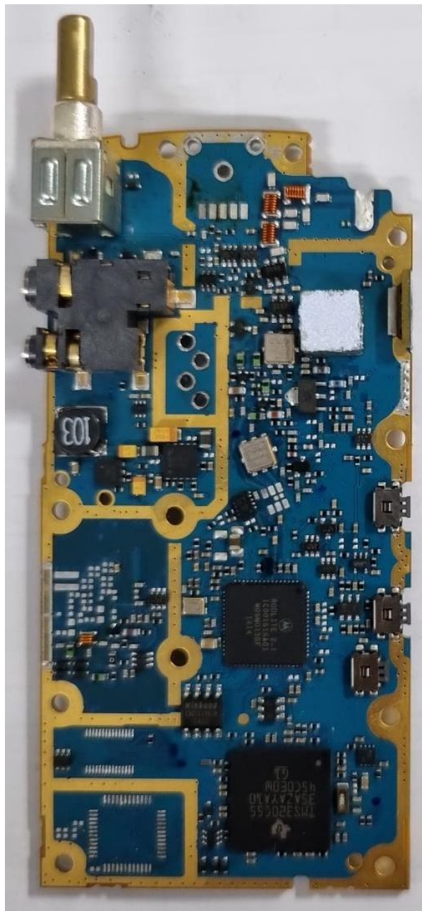
RMU2040 / RMU2043