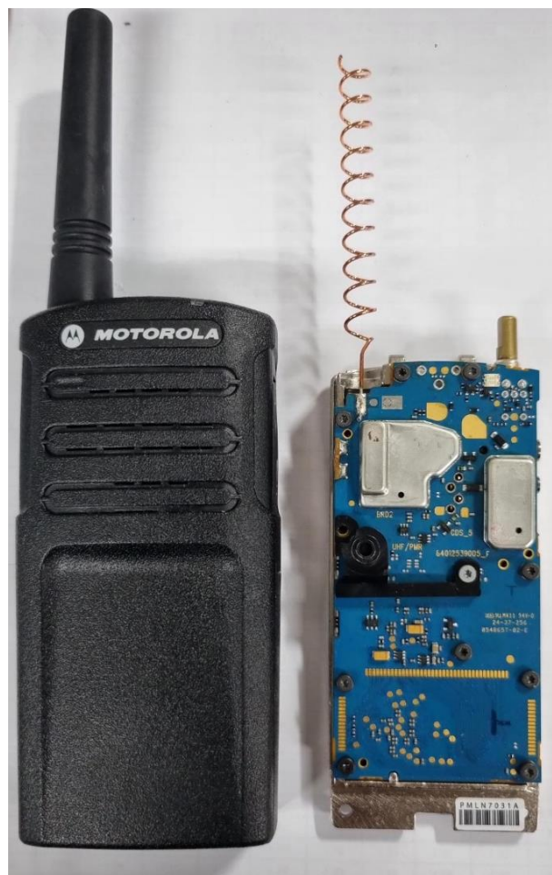
RMU2040 / RMU2043