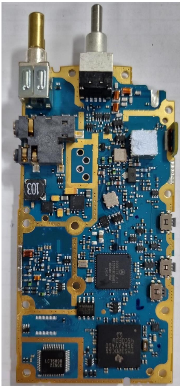
RMU2080 / RMU2080d