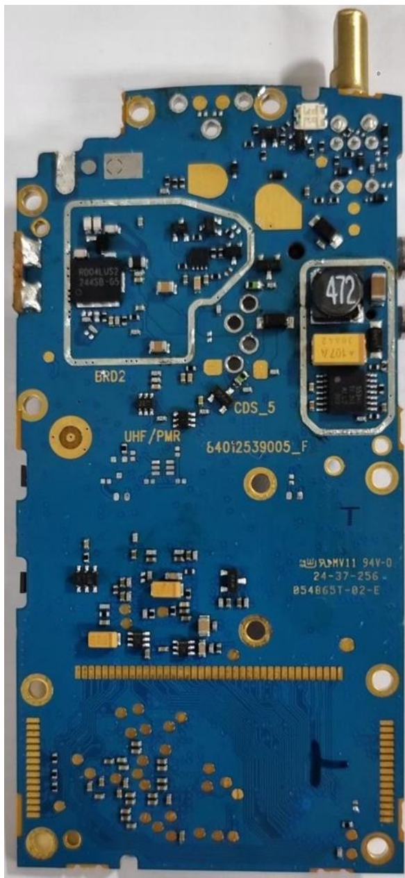
RMU2040 / RMU2043