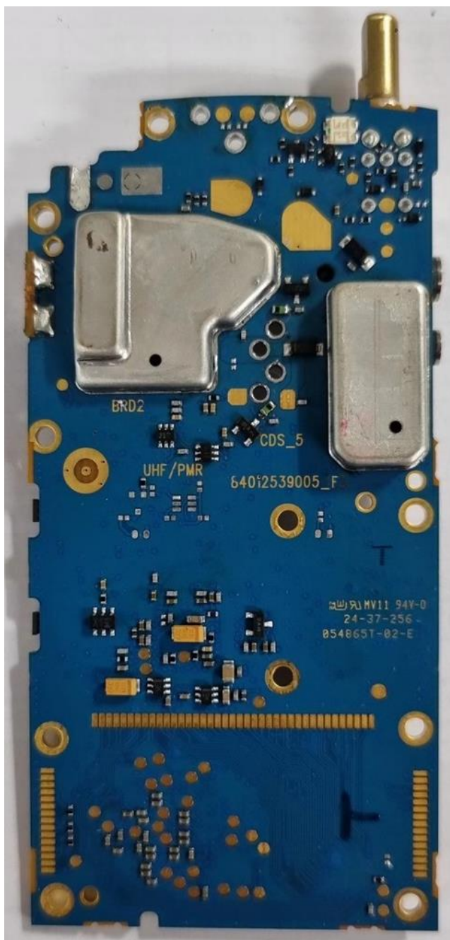
RMU2040 / RMU2043