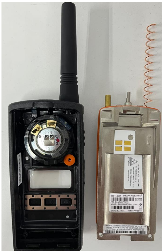
RMU2080 / RMU2080d