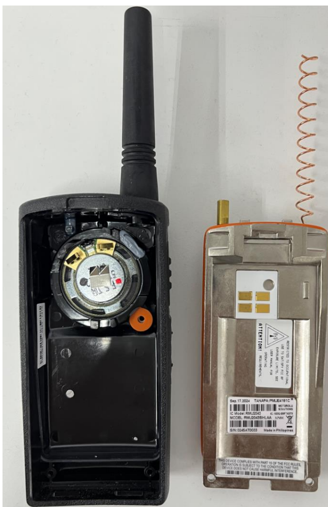
RMU2040 / RMU2043