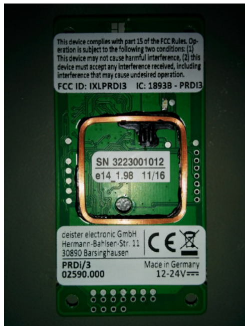
Article Label (38mm x 15mm)

deister electronic GmbH Hermann-Bahlsen-Str. 11 30890 Barsinghausen