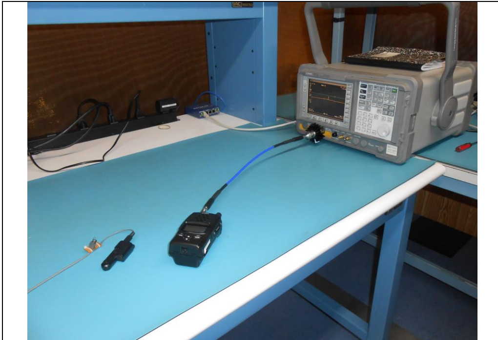
RF Conducted #2