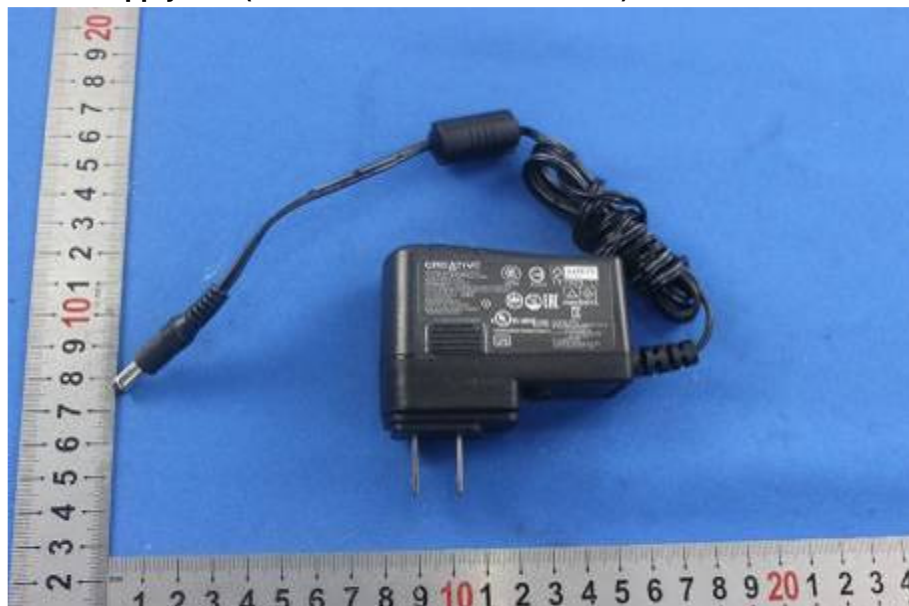
Power supply unit (model No.: GPE125-130100-Z)