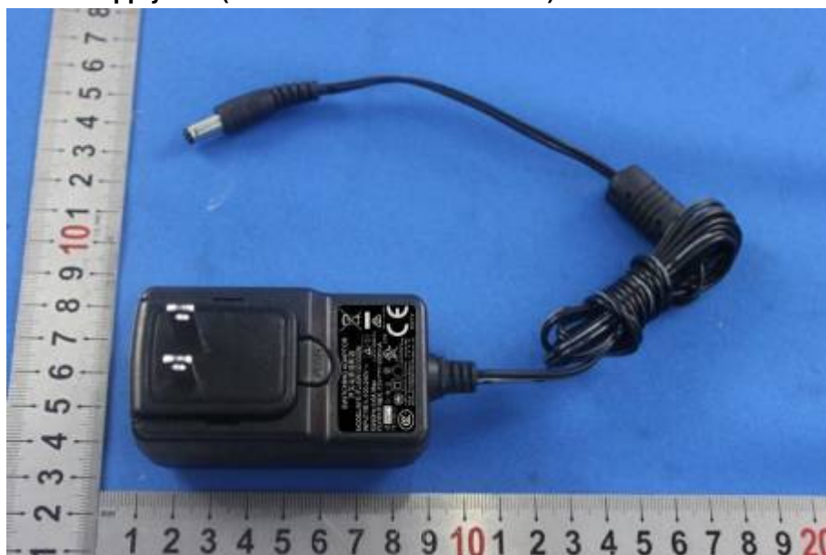
Power supply unit (model No.: FJ-SW1301000N)