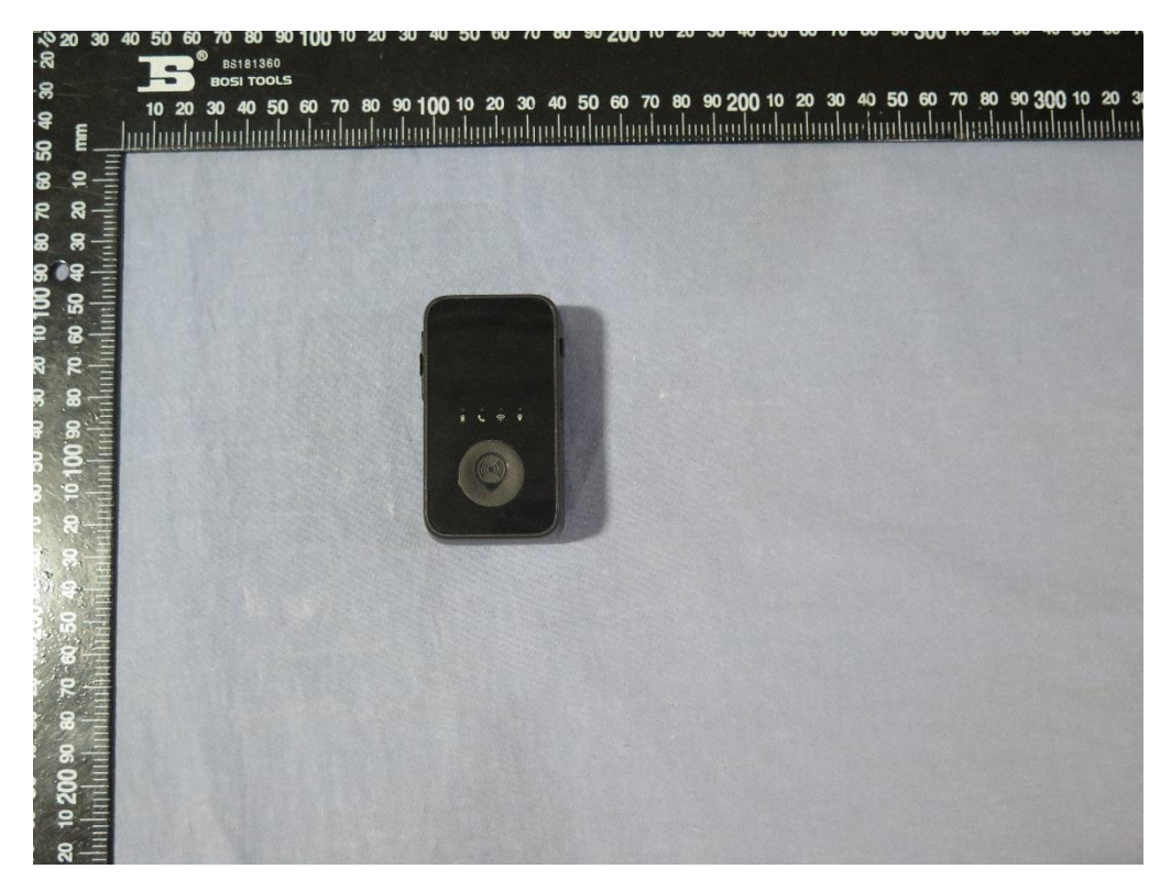
Front of the sample