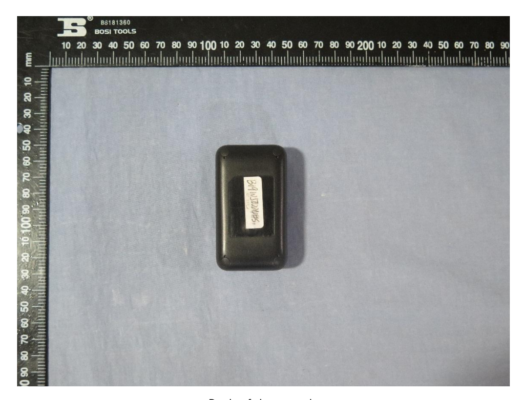
Back of the sample