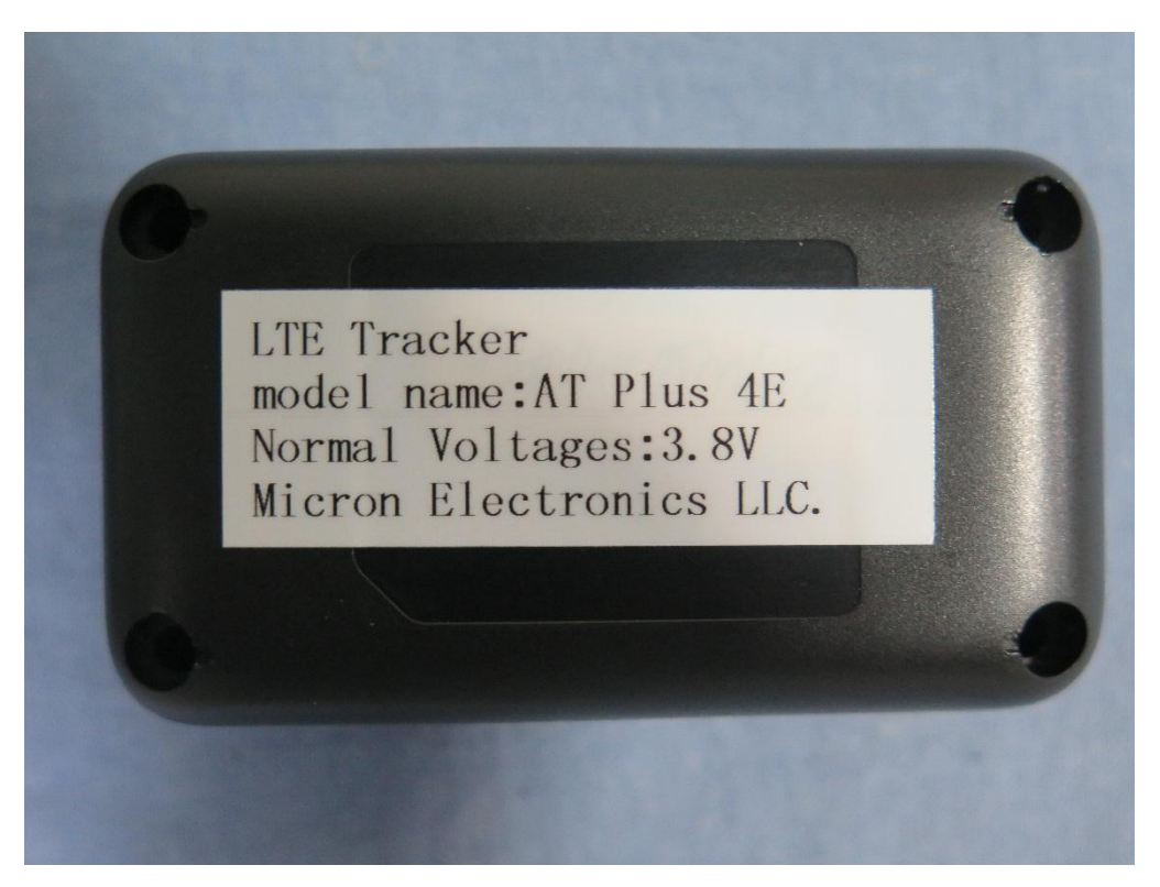
Nameplate of the sample