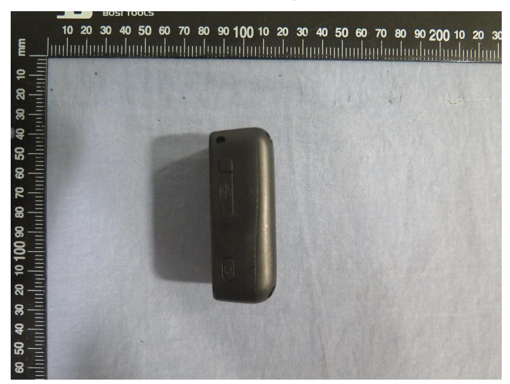
Side of the sample