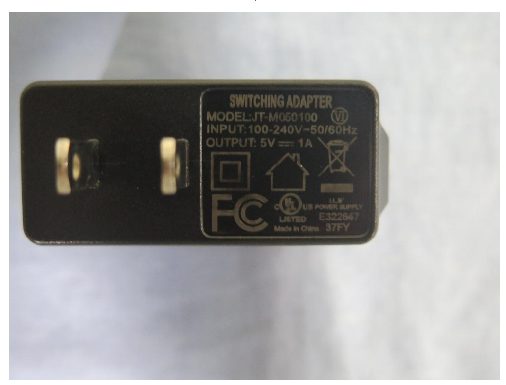
Nameplate of the Adapter