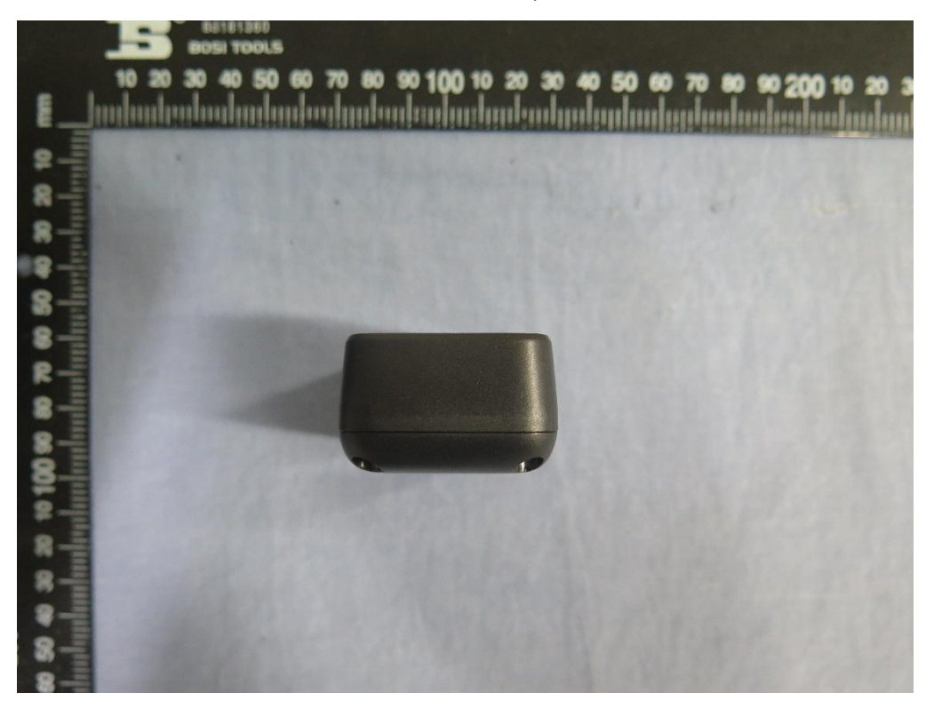
Side of the sample