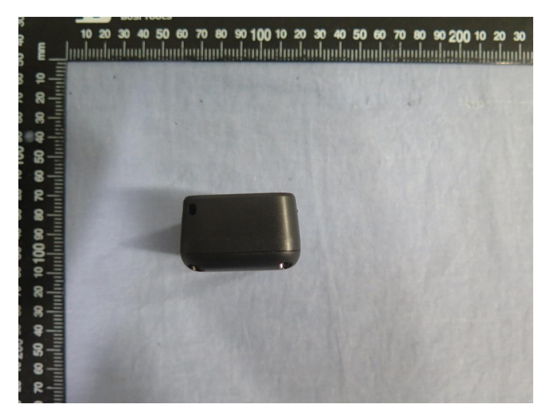
Side of the sample