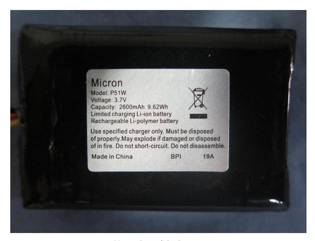
Nameplate of the battery