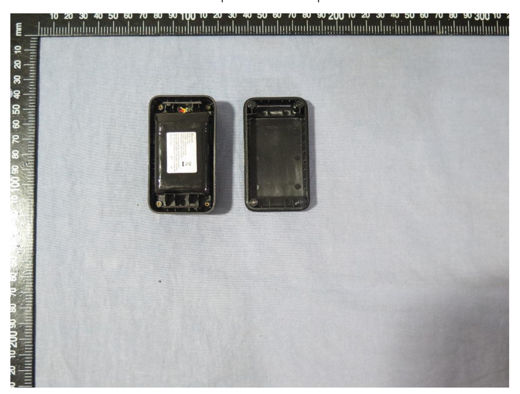
Open shell of the sample