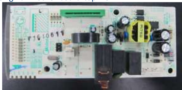
New Mother board -top view