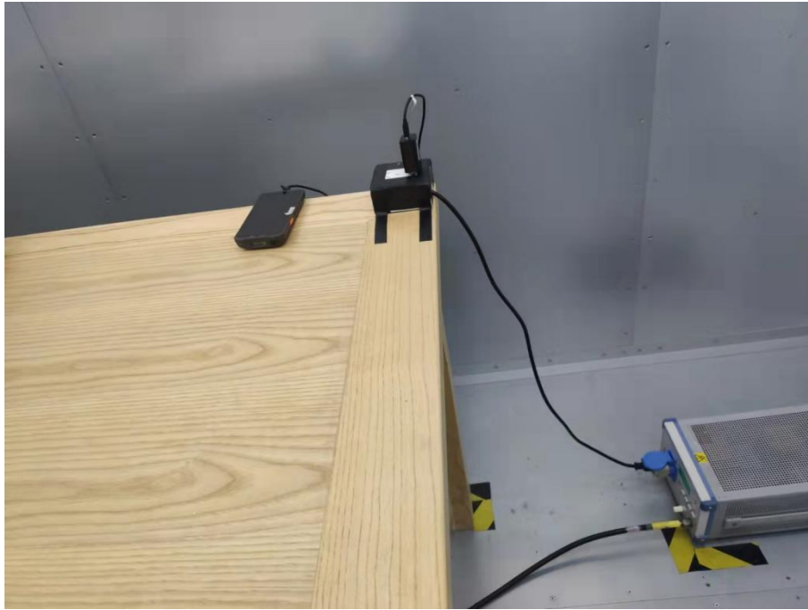
Picture3: Conducted Emissions