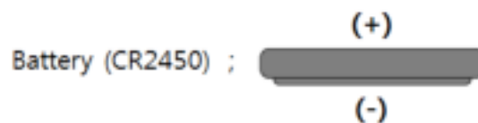
Figure 15. Battery Directional