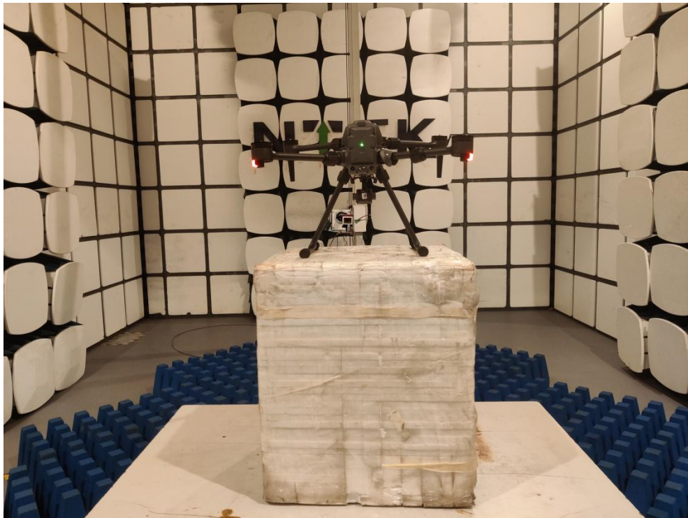
Conducted Measurement Photos