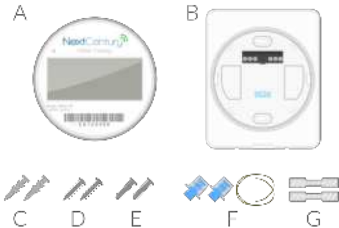
A - RR4-TR Remote Reader B - Mounting Plate C - Sheetrock Anchors D - Wall Mount Screws #6-20 E - Box Mount Screws #6-32 F - Wire Security Assembly G - Security Seal Tabs