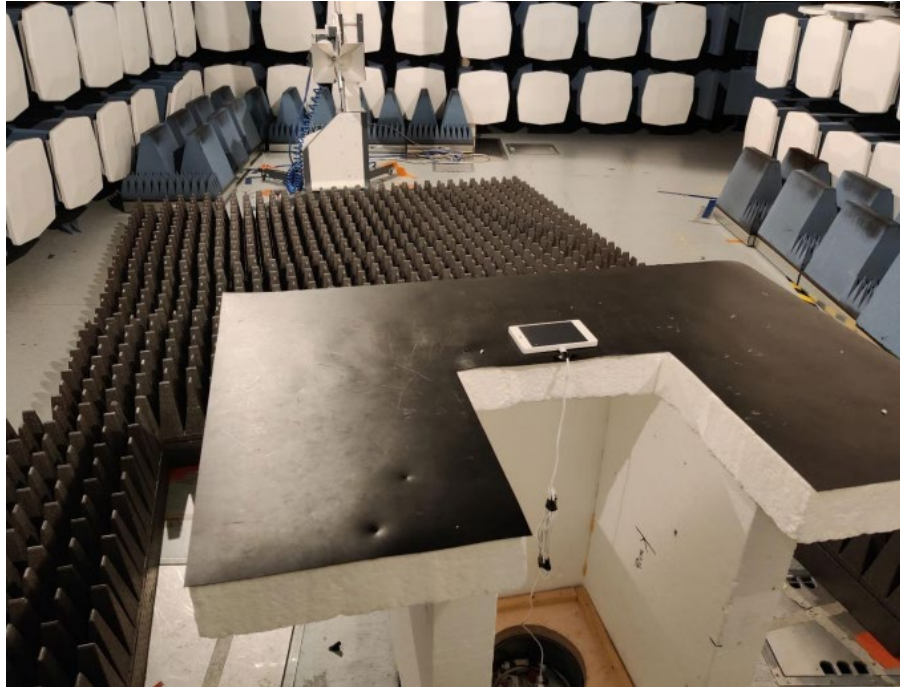
Radiated Spurious Emission, common setup, RX 1- 12,75 MHz

Haltian Oy Locator anchor with energy harvesting functionality SLF FCC ID: 2AEU3HAEHLO FCC part 15C, RSS-247, RSS-Gen 3670RER003A2 Eurofins Electric & Electronics Finland Oy