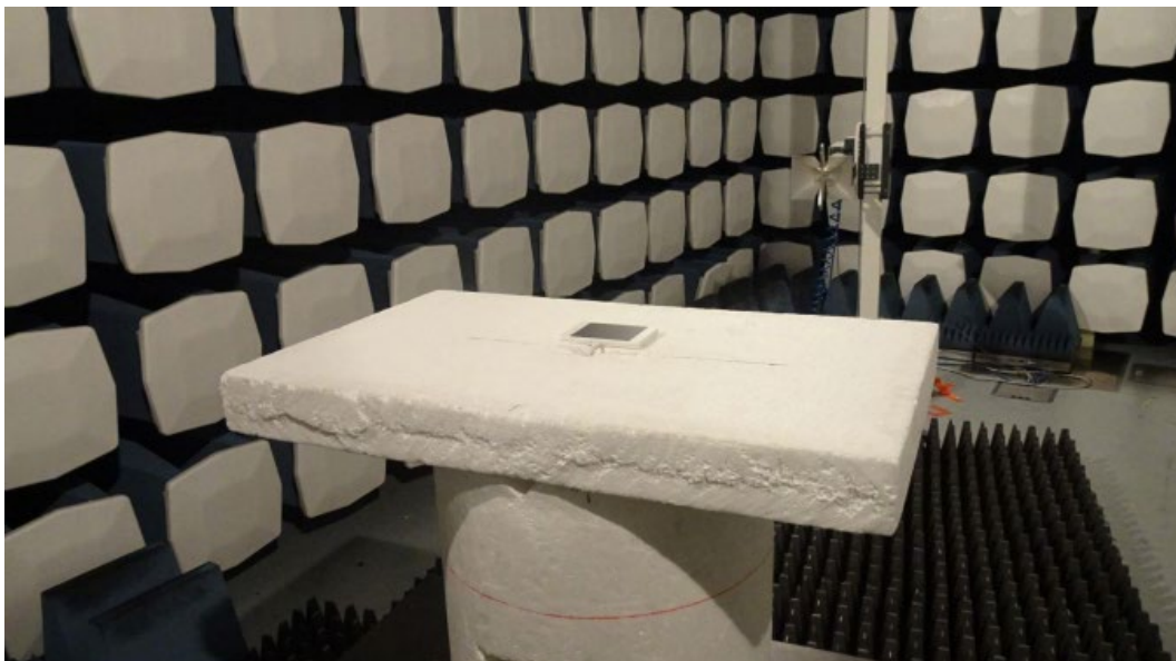
Radiated Spurious Emission, common setup, TX 1- 26 GHz