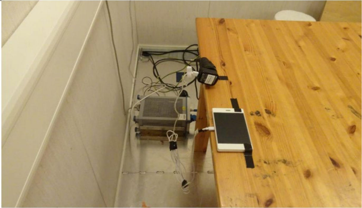
AC Power Line Conducted Emission

Haltian Oy Locator anchor with energy harvesting functionality SLF FCC ID: 2AEU3HAEHLO FCC part 15C, RSS-247, RSS-Gen 3670RER003A2 Eurofins Electric & Electronics Finland Oy