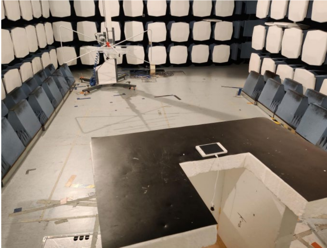
Radiated Spurious Emission, common setup, TX and RX 30-1000MHz

Haltian Oy Locator anchor with energy harvesting functionality SLF FCC ID: 2AEU3HAEHLO FCC part 15C, RSS-247, RSS-Gen 3670RER003A2 Eurofins Electric & Electronics Finland Oy