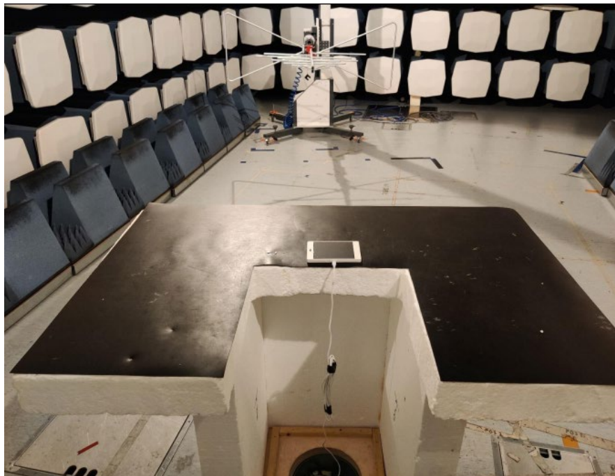
Radiated Spurious Emission, EUT, TX and RX 30-1000MHz