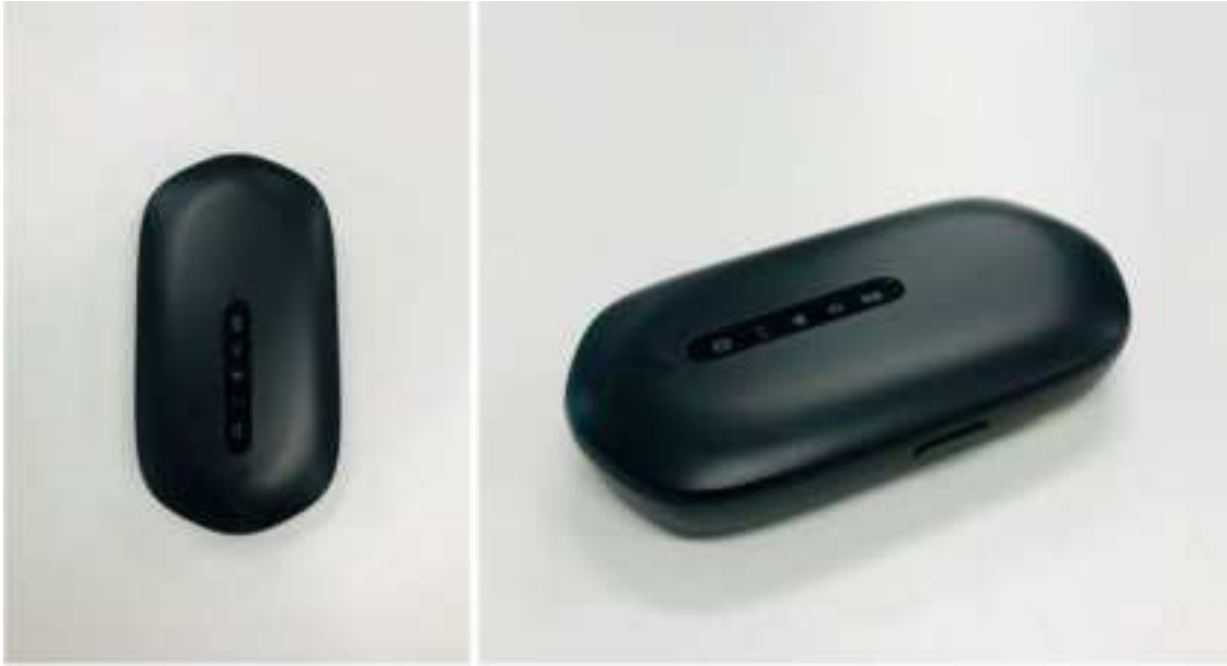
Figure 1. – Vector S7 wearable Device