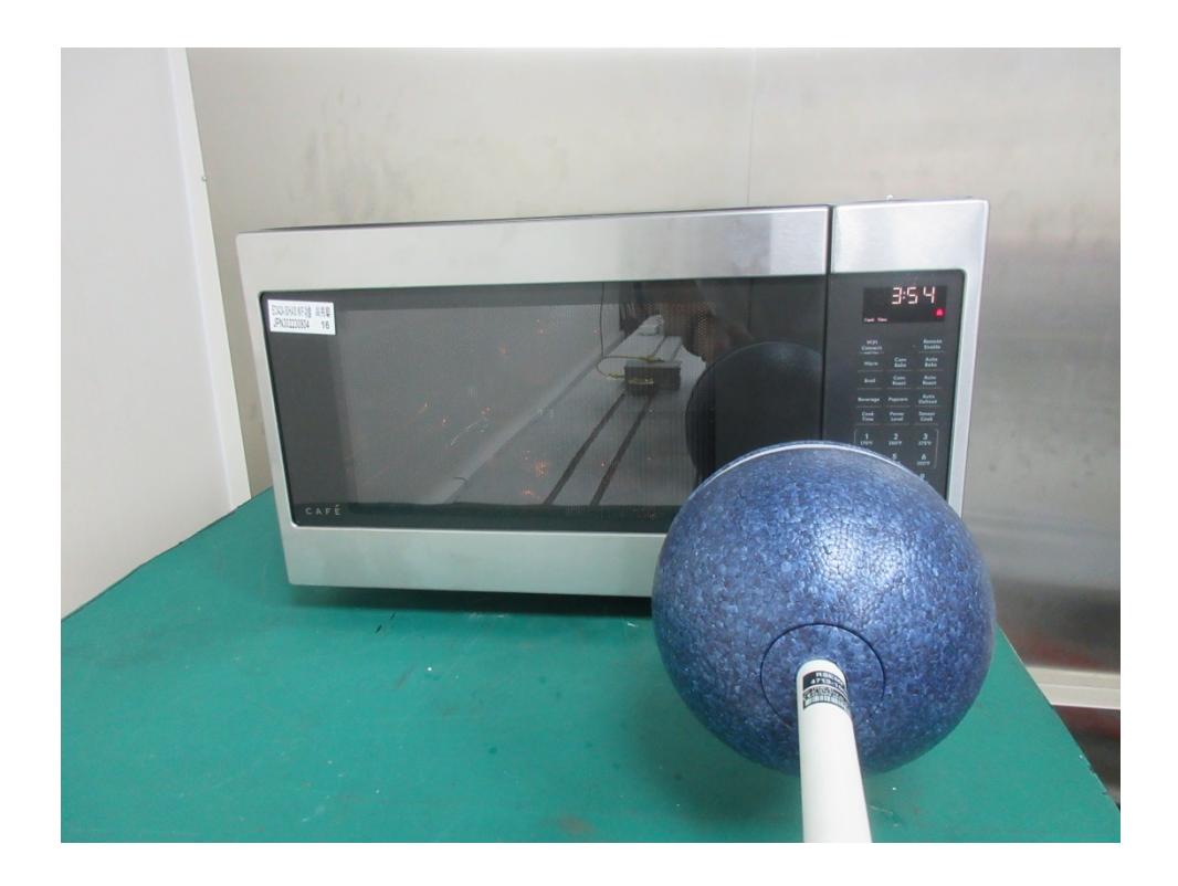
End of the report