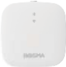
Bosma Aegis Wi-Fi Gateway*1