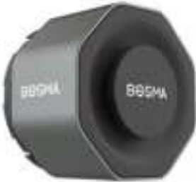
Aegis Smart Lock*1