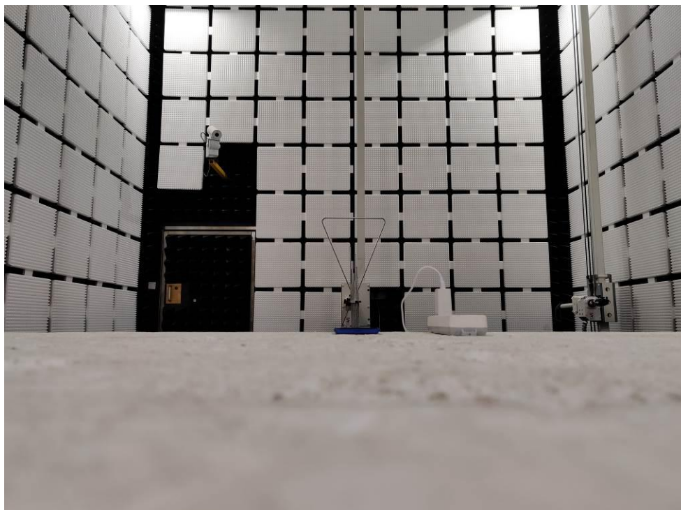
Fig. 1 (Below 1GHz)