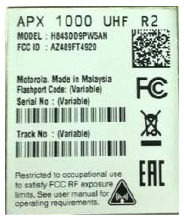
Figure 3: FCC Label for Sales model H84SDD9PW5AN (Model 1.5 Basic Keypad)