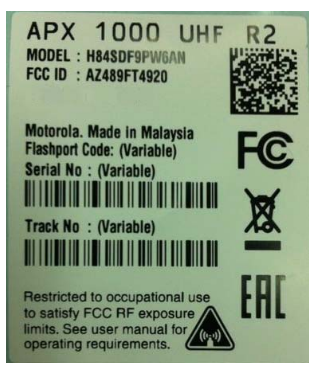
Figure 2: FCC Label for Sales model H84SDF9PW6AN (Model 2 Limited Keypad)