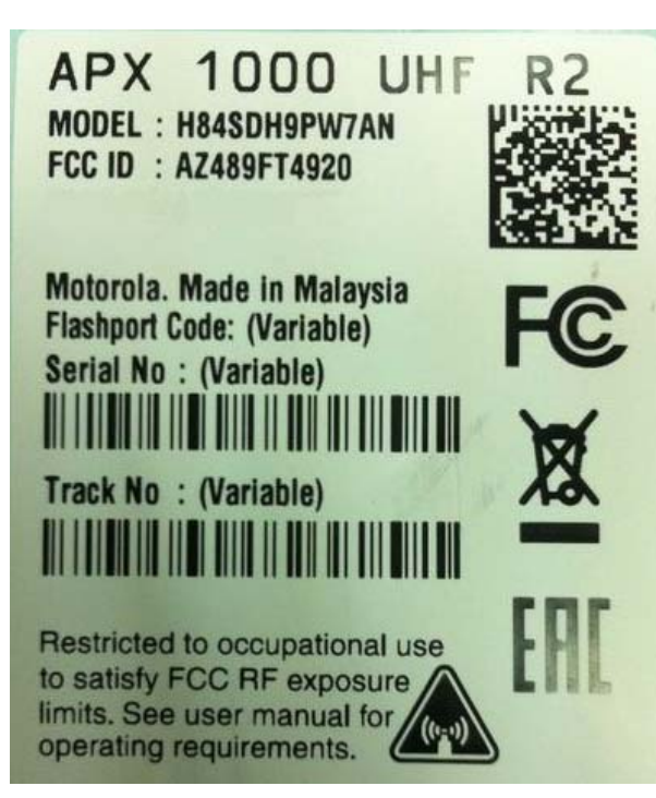
Figure 1: FCC Label for Sales model H84SDH9PW7AN (Model 3 Full Keypad)