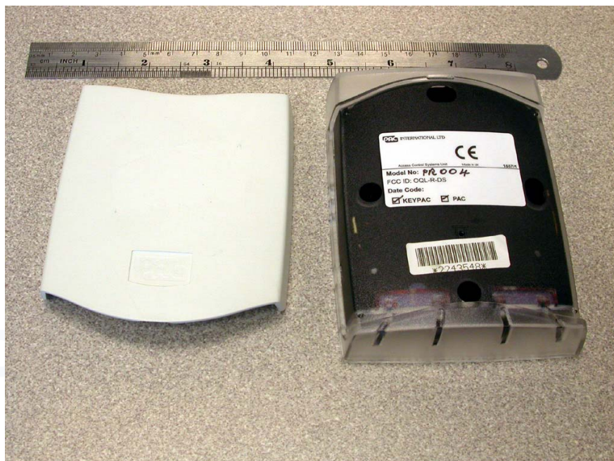
LABEL POSITION (FRONT)