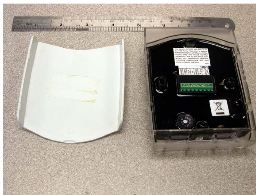
LABEL POSITION (REAR)