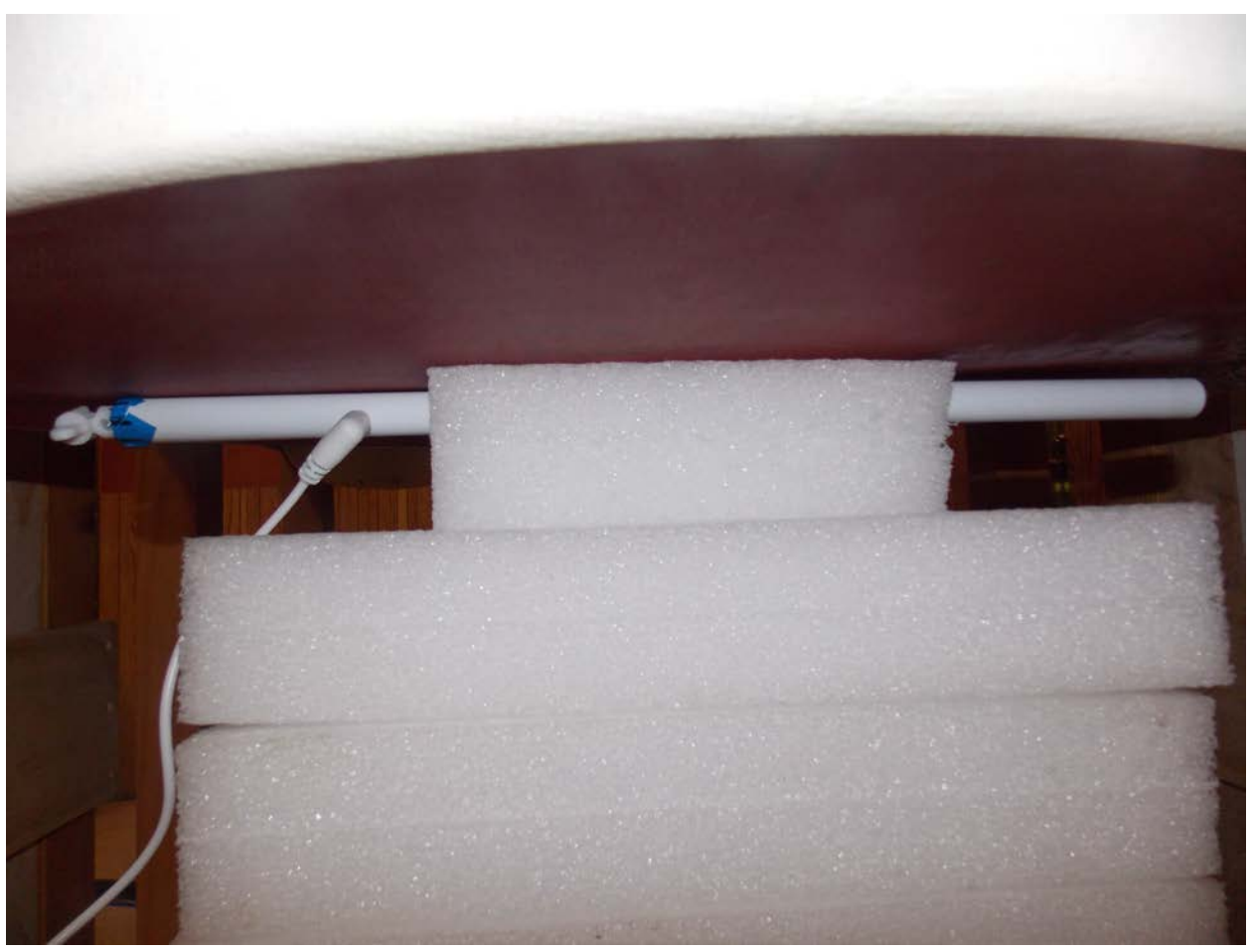
Test Position 0 mm Gap

Note: All cables removed prior to testing.