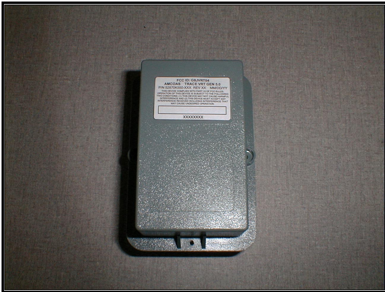
PHOTOGRAPH 2: LOCATION OF LABEL ON DEVICE

Please refer to the following page for the label sample.