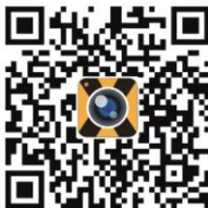
iOS App QR Code

By APP : firstly make sure the phone networking, open APP, after connecting the camera, if the new version is available, it will be automatically prompted to upgrade.