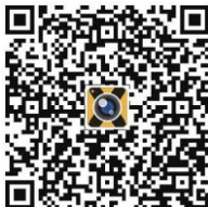
Android App QR Code

d. APP installation: the phone system requires Android 4.1 and above or IOS7 or more, scanning "XDV" APP dimensional code, follow the prompts to complete the installation.