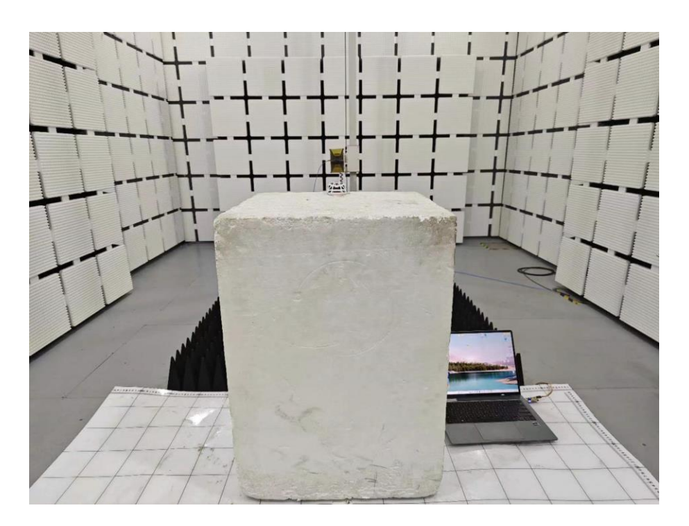
Set-up for Radiated Spurious Emission, Above 1GHz

Set-up for Radiated Spurious Emission, Below 1GHz