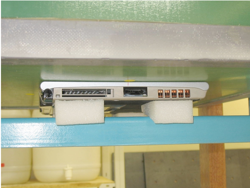
Arm Held Position