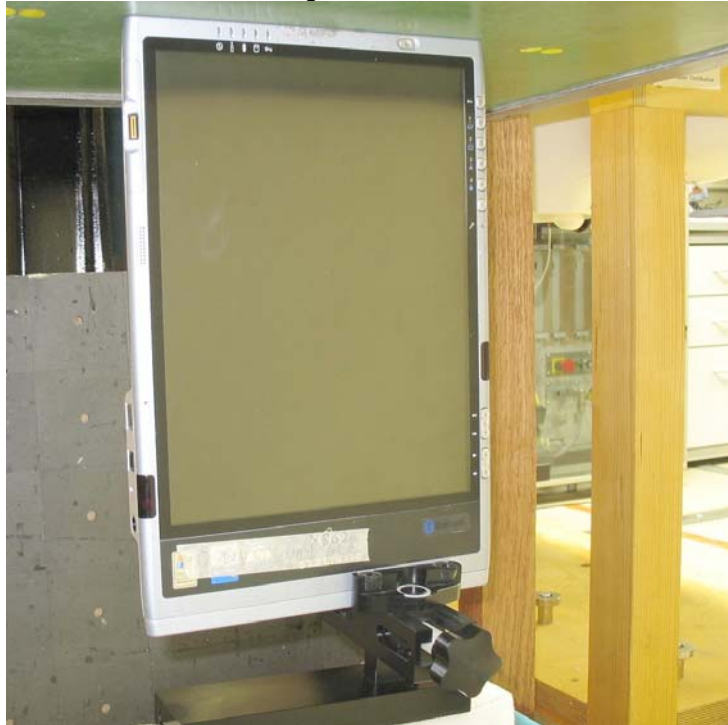
Edge On Position