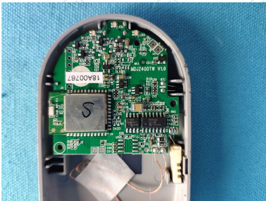
View of Product-7