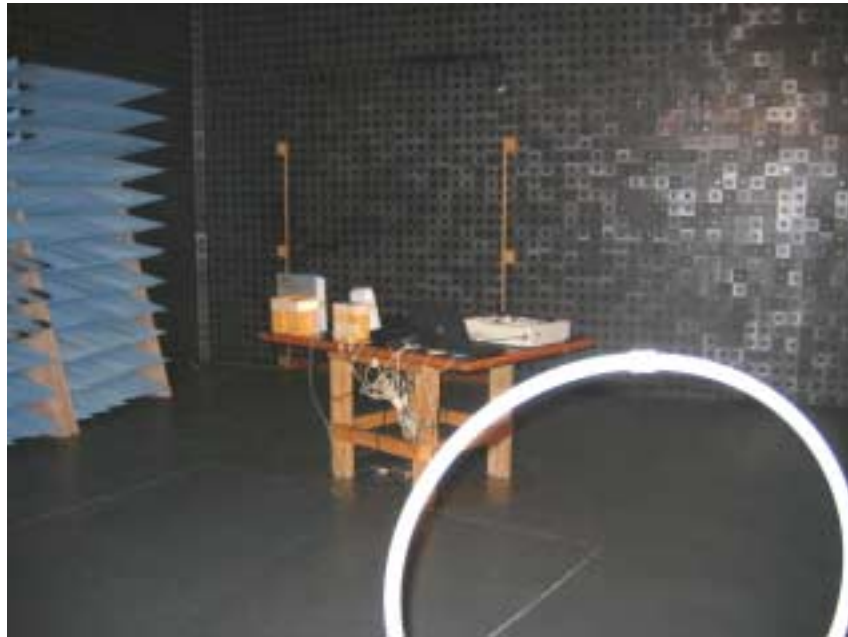
Photograph No.1 Spurious emissions measurement setup in the anechoic chamber below 30 MHz, EUT with panel antenna