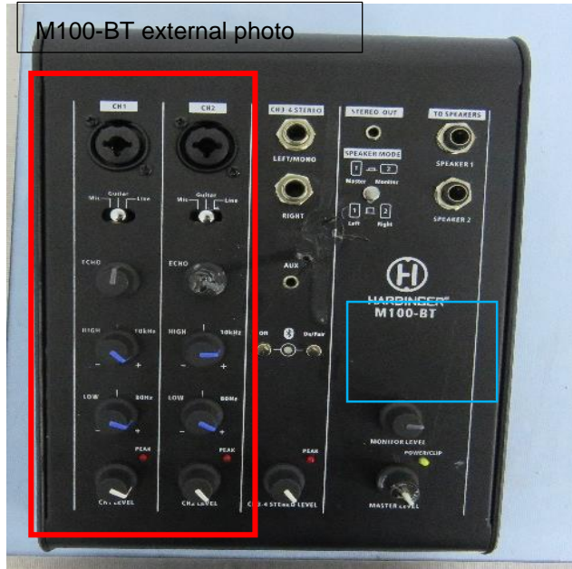
M100-BT external photo