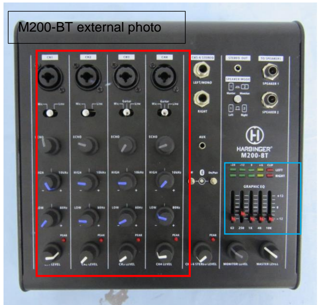
M200-BT external photo