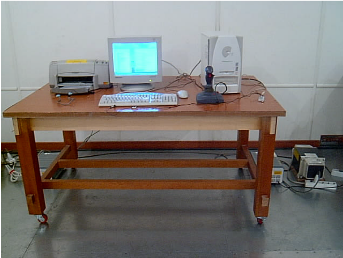
<FRONT PHOTO OF CONTINUOUS DISTURBANCE VOLTAGE >