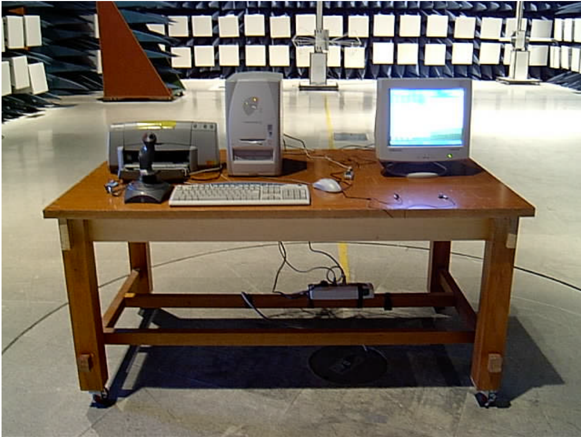
<FRONT PHOTO OF RADIATED DISTURBANCE >