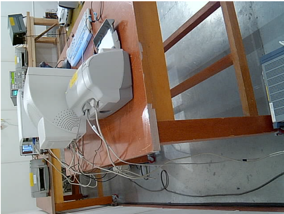
<SIDE PHOTO OF CONTINUOUS DISTURBANCE VOLTAGE >