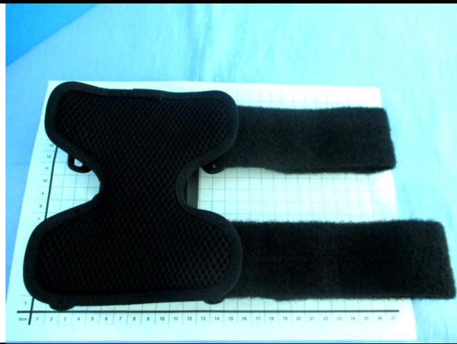
Arm – Front View