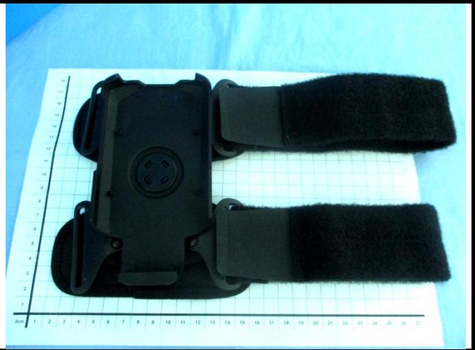
Arm – Rear View