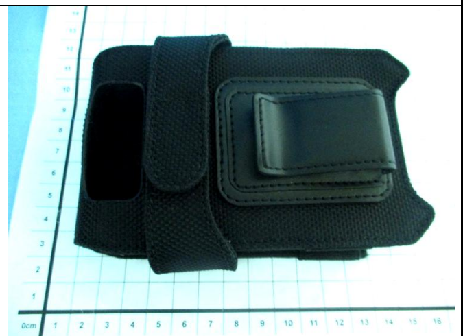
Holster – Rear View