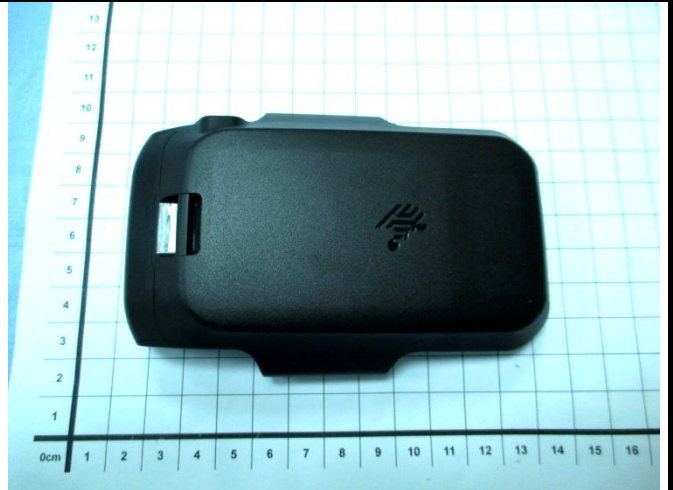
Power Back –Rear View