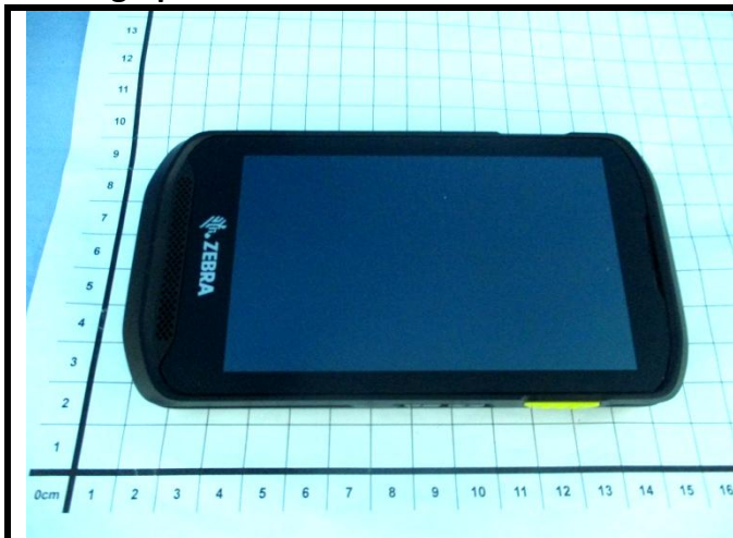
EUT – Front View