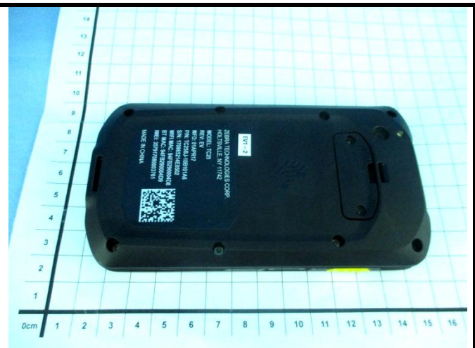
EUT – Rear View