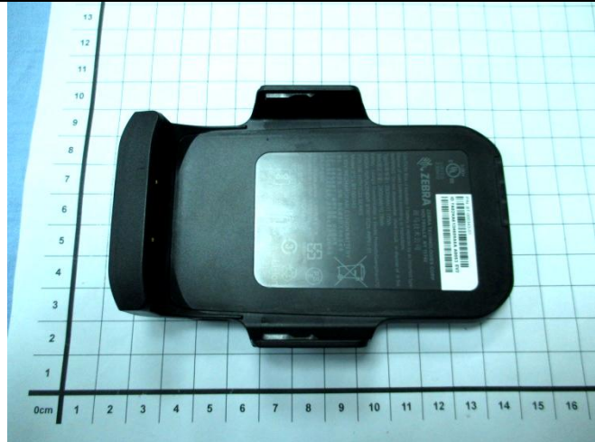
Power Back – Front View